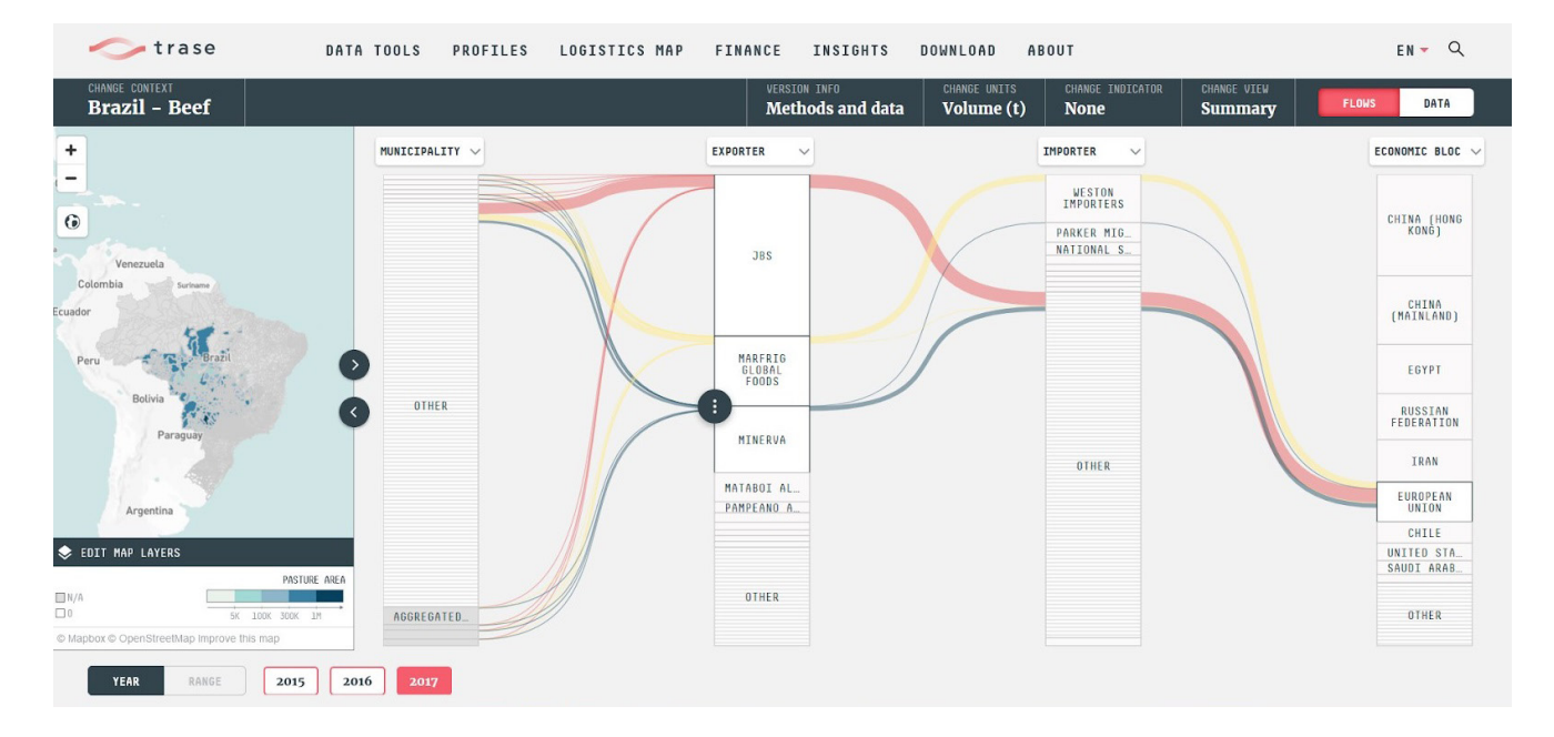
FIGURE 1: SUPPLY CHAIN OF BEEF FROM BRAZILIAN MUNICIPALITIES TO THE EUROPEAN UNION

The lack of transparency creates opportunities to hide illegal sales of cattle from farms that have been sanctioned for human rights violations and illegal deforestation. It allows