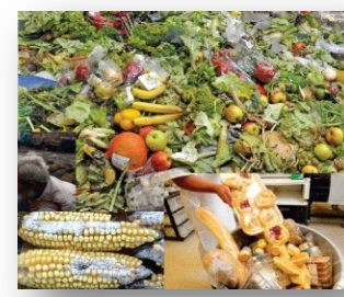
Reducing post harvest losses, food waste