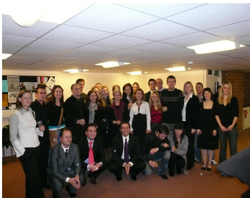
SEI post-graduate students at graduation