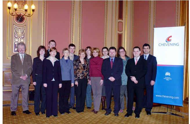
The 2006-07 Chevening Fellows