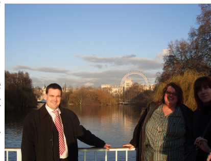
The Chevening Fellows visiting London

I also have to mention that all the visits to London were really exciting as they provided opportunities for a journalist like me to meet officials, high-level ministry experts and to acquire in-depth information about UK’s Euro-