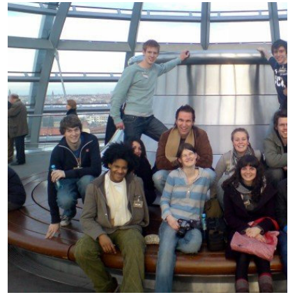
Sussex students in Berlin's Bundestag

All of the students had either taken the course entitled 'Political Change: Modern Germany', or they are currently taking 'Political Governance: Modern Germany' course.