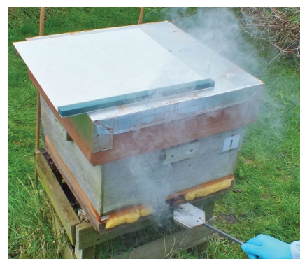
Treating a hive in winter with oxalic acid using the sublimation method. The oxalic acid is turned into a gas using a heated tool which is inserted into the hive entrance. For the purpose of the photo the tool has not been inserted and the oxalic acid vapour can be seen.