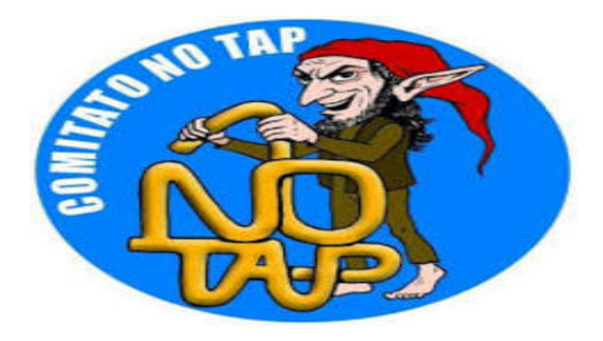
Fig. 18. Committee No TAP in Puglia, Italy.

threatens ancient olive farms, water sources, cultural heritage sites and a stunning coastline. It is part of the larger project called the Southern Gas Corridor carrying gas to Europe which includes the Trans Anatolian Pipeline (TANAP) and the Trans Caspian Gas Pipeline.