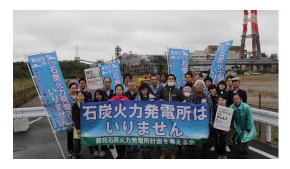
Fig. 5. Kiko network. https://ejatlas.org/conflict/soga-coal-poer-chiba-japan

This opposition is paralleled in Chiba prefecture against the Soga CFPP of about 1,070 MW and estimated to produce 6.42 million tons of CO2 per year. (Fig. 5). Citizens worry that their living conditions get worse in an already polluted area. There is strong support from other groups in Japan concerned with climate change. Notice that the amount of carbon dioxide per year released by the economy of Japan amounts to 1.2 billion tons of CO2, or almost 10 tons per capita. Keeping Soga CFPP out would represent about 0.5 % decrease in emissions for Japan in the absence of "leakage", i.e. that this decrease is not compensated by new emissions elsewhere: hence the relevance of NIABY movements (neither here nor anywhere).