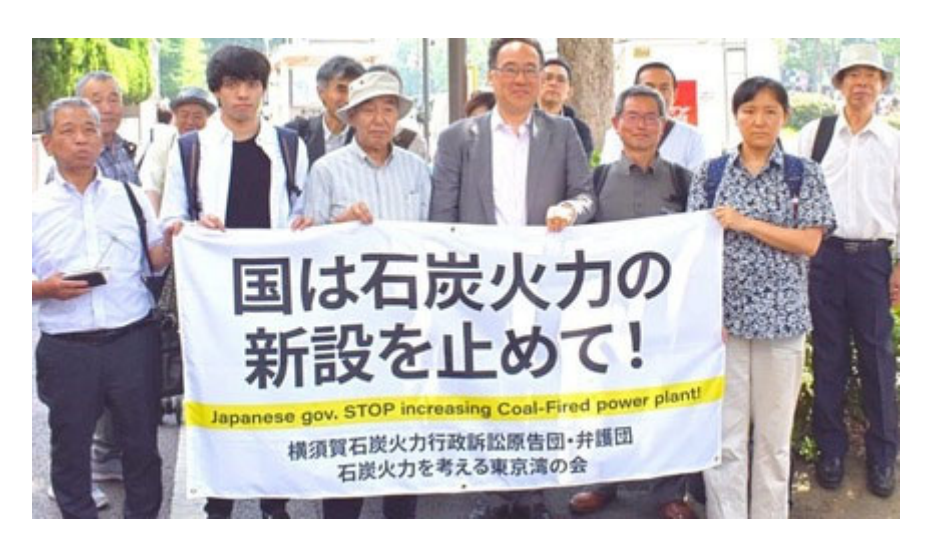
Fig. 4. https://beyond-coal.jp/local-activities/yokosuka/. https://ejatlas.org/conflict/yokosuka-coal-power-plant

After two cases from the Philippines, the third and fourth, also on coal, are from Japan. They all propose in practice "degrowth of fossil fuels" based on environmental justice. In Japan there are several protests against new CFPP (coal fired power plants) because of a certain "coal renaissance" after the Fukushima disaster, e.g. the current citizens protests against a two unit CFPP in Yokosuka City in Tokyo Bay deemed to emit 7.26 million tons of carbon dioxide annually. (Fig. 4). The CFPP is being developed on the former Yokosuka thermal power plant site that has a 60-year long history in the Kanagawa Prefecture. It will be equipped with two units of 650MW capacity each, i.e. 1300MW.