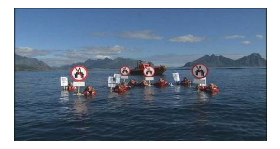
Fig. 12. Protest action at Lofoten islands. <a href="https://ejatlas.org/conflict/oil-drilling-lofoten-norway">https://ejatlas.org/conflict/oil-drilling-lofoten-norway</a>

Very far from Argentina, in the Lofoten islands off the coast of Norway, success was reached in the attempts to "leave oil in the ground", estimated at about 1.3 billion barrels. For many years there was a debate on whether to get oil from the biodiversity-rich Lofoten islands. By 2019 the question is temporarily settled. The forward march of the Norwegian oil-extractive economy to new commodity frontiers continues elsewhere. The Lofoten archipelago is a highly biodiverse area that holds cold-water reefs, pods of sperm whales and killer whales. It has some of the largest colonies of seabirds in Europe and it is the spawning grounds of what is deemed to be largest cod stock in the world. After years of civil society efforts, by 2019 the alarm at climate change meant that the Labor Party, the country's biggest force in Parliament and a long-time backer of the oil industry, decided to stop pushing for oil exploration in the sensitive Lofoten islands. (Fig. 12).