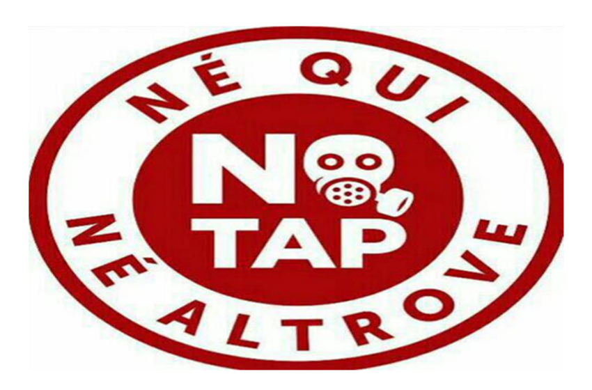
Fig. 17. Against the TAP in Puglia <a href="https://ejatlas.org/conflict/trans-adriatic-pipeline-in-puglia-italy">https://ejatlas.org/conflict/trans-adriatic-pipeline-in-puglia-italy</a>

There are similar pipeline cases elsewhere. For instance, in Southern Italy Né qui né altrove is the translation of NIABY (not in anyone's backyard) into Italian. NIABY is commonly used by the environmental movements elsewhere as a reply to NIMBY framings. (Fig. 17 and 18).