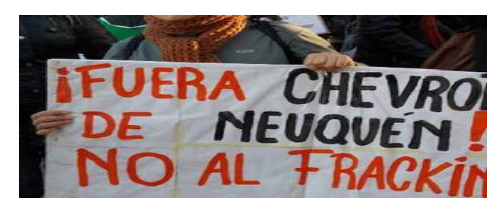
Fig. 10. Not to fracking in Neuquén. <a href="https://ejatlas.org/conflict/loma-de-la-lata-neuquen-argentina">https://ejatlas.org/conflict/loma-de-la-lata-neuquen-argentina</a>

Allen, Río Negro, is a fruit growing zone, with irrigation, settled by Italian Immigrants decades ago. It belongs to the Vaca Muerta formation that has reached it from its principal main área in Añelo. The government agreement with Chevron was signed in 2013. This is a "commodity widening" and "commodity deepening" process at the same time. There is local resistance (Fig. 11).