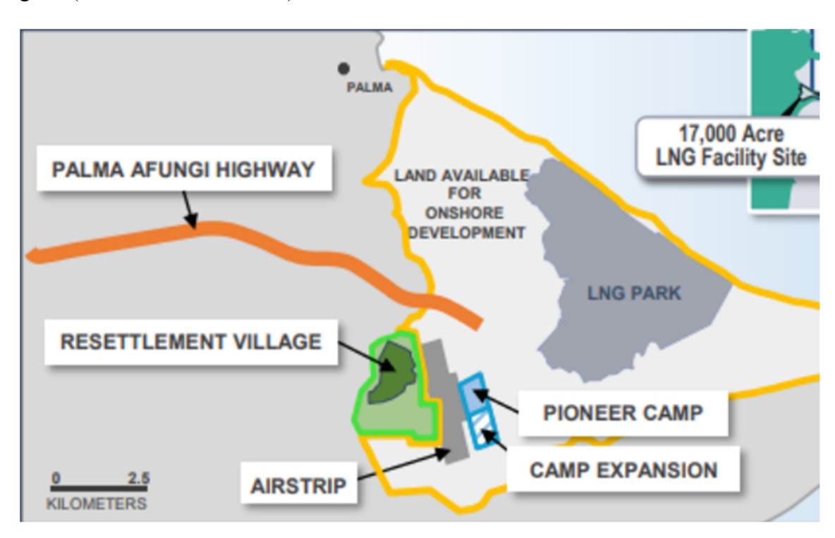
Fig. 19. Afungi airport and LNG park. Palma, Cabo Delgado, Mozambique. Source: Anadarko. Stay Grounded. <a href="https://ejatlas.org/conflict/afungi-lng-construction-site">https://ejatlas.org/conflict/afungi-lng-construction-site</a>

elsewhere<sup>3</sup>. The awful events at Palma, a town on the coast of Mozambique immediately south of the border with Tanzania, happened because this is the base of LNG operations for the growing offshore Mozambique natural gas industry. Although initially community relocation seemed successful (Symons, 2019), the gas project leads to major local changes and violence, evicting and displacing farming and fishing communities who lost their livelihoods, giving major incentives for the youth to join Islamist rebel groups. Over half the population of Cabo Delgado is Muslim. This is a case of enclave or "bunker" extractivism (fig. 19) where Total hopes with Mozambican and foreign troops to secure about 7,000 hectares. In March 2021 South African mercenary military security flying helicopters battled the Islamist insurgents. What will be the price of this colonial natural gas? (Amis de la Terre, 2020).