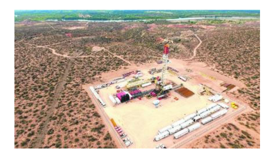
Fig. 11. Oil extraction platform in Estación Fernández Oro. <a href="https://ejatlas.org/conflict/allen-y-la-extraccion-de-gas-por-fractura-hidraulica">https://ejatlas.org/conflict/allen-y-la-extraccion-de-gas-por-fractura-hidraulica</a>

Very far from Argentina, in the Lofoten islands off the coast of Norway, success was reached in the attempts to "leave oil in the ground", estimated at about 1.3 billion barrels. For many years there was a debate on whether to get oil from the biodiversity-rich Lofoten islands. By 2019 the question is temporarily settled. The forward march of the Norwegian oil-extractive economy to new commodity frontiers continues elsewhere. The Lofoten archipelago is a highly biodiverse area that holds cold-water reefs, pods of sperm whales and killer whales. It has some of the largest colonies of seabirds in Europe and it is the spawning grounds of what is deemed to be largest cod stock in the world. After years of civil society efforts, by 2019 the alarm at climate change meant that the Labor Party, the country's biggest force in Parliament and a long-time backer of the oil industry, decided to stop pushing for oil exploration in the sensitive Lofoten islands. (Fig. 12).