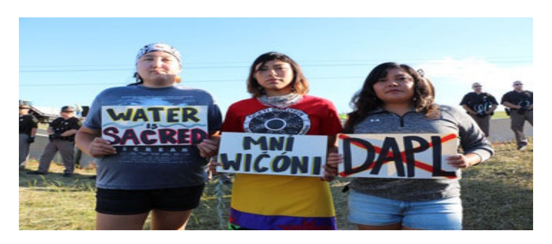
Fig. 13. The DAPL. <a href="https://ejatlas.org/conflict/dakota-access-pipeline">https://ejatlas.org/conflict/dakota-access-pipeline</a>

To stop pipelines is often an objective of local environmental movements reinforced by global concerns about climate change. The word "Blockadia" was born in these encounters in North America (the USA and Canada), often involving indigenous population (Temper, 2019). Thus Sioux complained against the Dakota Access Pipeline (DAPL), USA, arguing that "water is sacred" and therefore economic compensation is not the issue. The DAPL, with the Standing Rock famous protest, would be connected to the Keystone XL pipeline, a network of pipelines that would carry oil from the Canadian tar-sands in Alberta to refineries in the United States. The DAPL is an 1886 km oil pipeline that would transport nearly 500,000 barrels of crude oil a day (25 million tons per year) from North Dakota to Illinois, where it would be shipped to refineries. (Fig. 13 and Fig. 14).