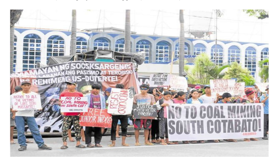
Fig. 2. Against coalmining in South Cotabato, Philippines. https://ejatlas.org/conflict/coal-mining-in-barangay-ned-south-cotabato-philippines.

used by the San Miguel Corporation: a clear case of "commodity widening" (expanding territorial control). The project was stopped (Delina 2021).