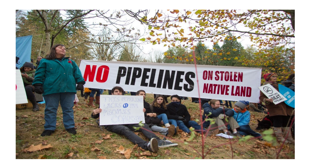
Fig. 16. Canada. Rally on 17 November 2014. <a href="https://ejatlas.org/conflict/the-kinder-morgan-trans-mountain-pipeline-expansion-project-in-british-columbia-canada">https://ejatlas.org/conflict/the-kinder-morgan-trans-mountain-pipeline-expansion-project-in-british-columbia-canada</a>

There are similar pipeline cases elsewhere. For instance, in Southern Italy Né qui né altrove is the translation of NIABY (not in anyone's backyard) into Italian. NIABY is commonly used by the environmental movements elsewhere as a reply to NIMBY framings. (Fig. 17 and 18).