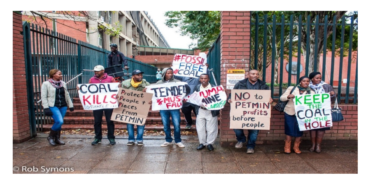
Fig. 7. Keep the coal in the hole. 5 Nov. 2020. (Photo Rob Symons). <a href="https://www.iol.co.za/the-star/opinion-analysis/mam-ntshangase-murder-lives-of-human-rights-defenders-whistle-blowers-must-be-protected-8ee4ef49-b066-4471-afaa-bd1d7442e8ce">https://www.iol.co.za/the-star/opinion-analysis/mam-ntshangase-murder-lives-of-human-rights-defenders-whistle-blowers-must-be-protected-8ee4ef49-b066-4471-afaa-bd1d7442e8ce</a>.

Finally, another movement against a CFPP in the small island of Jamaica. In February 2017 it seemed that the Chinese company Jiuquan Iron & Steel would build a 1000 MW coal power plant at the Alpart bauxite-alumina factory. This is a conflict on a CFPP and at the same time could become a conflict on bauxite mining. In July 2016 it was reported that the Russian mining company signed a deal for the US$300-million sale of its 1.6-