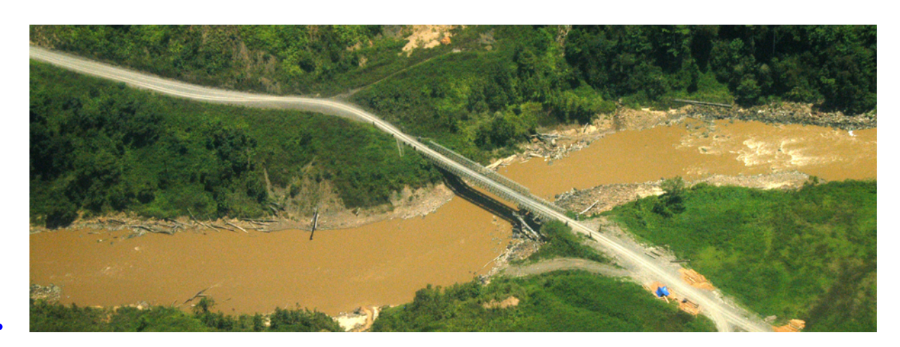
Shifting Positions or: Wooing smallholders in advance of upcoming national elections? Carol Yong 26 January 2018