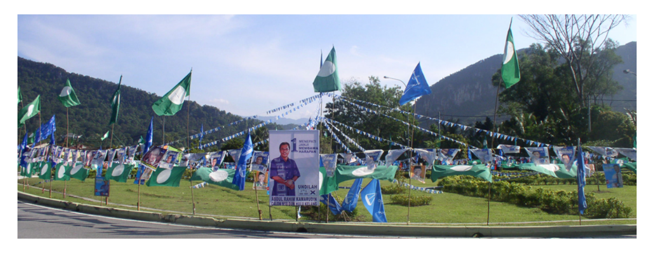
"Oui, we buy!" The French Connection in the "crop-apartheid" affair Carol Yong, 26 January 2018

Atrocities against women and girls as tool for "devil-worshippers" cleansing Carol Yong 26 January 2018