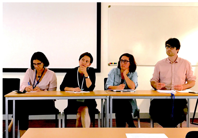
ASA Conference 2019

is the deficit? based on her doctoral research. A notable theme of the conference was the degree to which Foundation practitioners view students' lived experiences as an asset to draw on, rather than a deficit to be remedied.