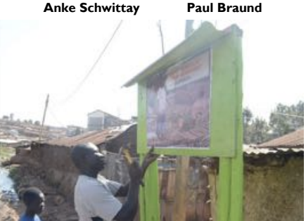
Installing a flood notice board in Kibera