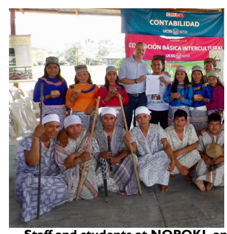
Staff and students at NOPOKI, an indigenous university in Peru

Bringing together a group of engaged Peruvian and international scholars and practitioners together with local activists and community members, the project seek to pool collective strengths and experience to engage in these social and environmental challenges. In putting indigenous peoples at its heart, the project will explore the advantages of collaborative approaches while emphasising that local communities often offer their own potential solutions to our shared global challenges.