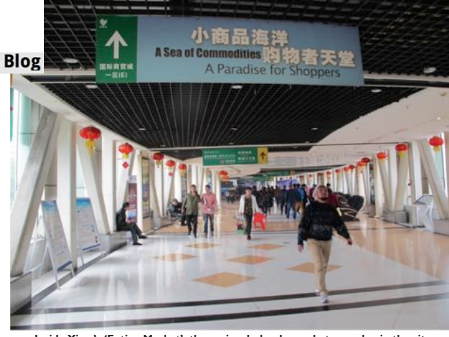
Inside Yiwu's 'Futian Market', the main wholesale market complex in the city

Diana's work is part of the Sussex-based TRODITIES project that is enquiring into the human stories that are embedded within the global movements of goods.