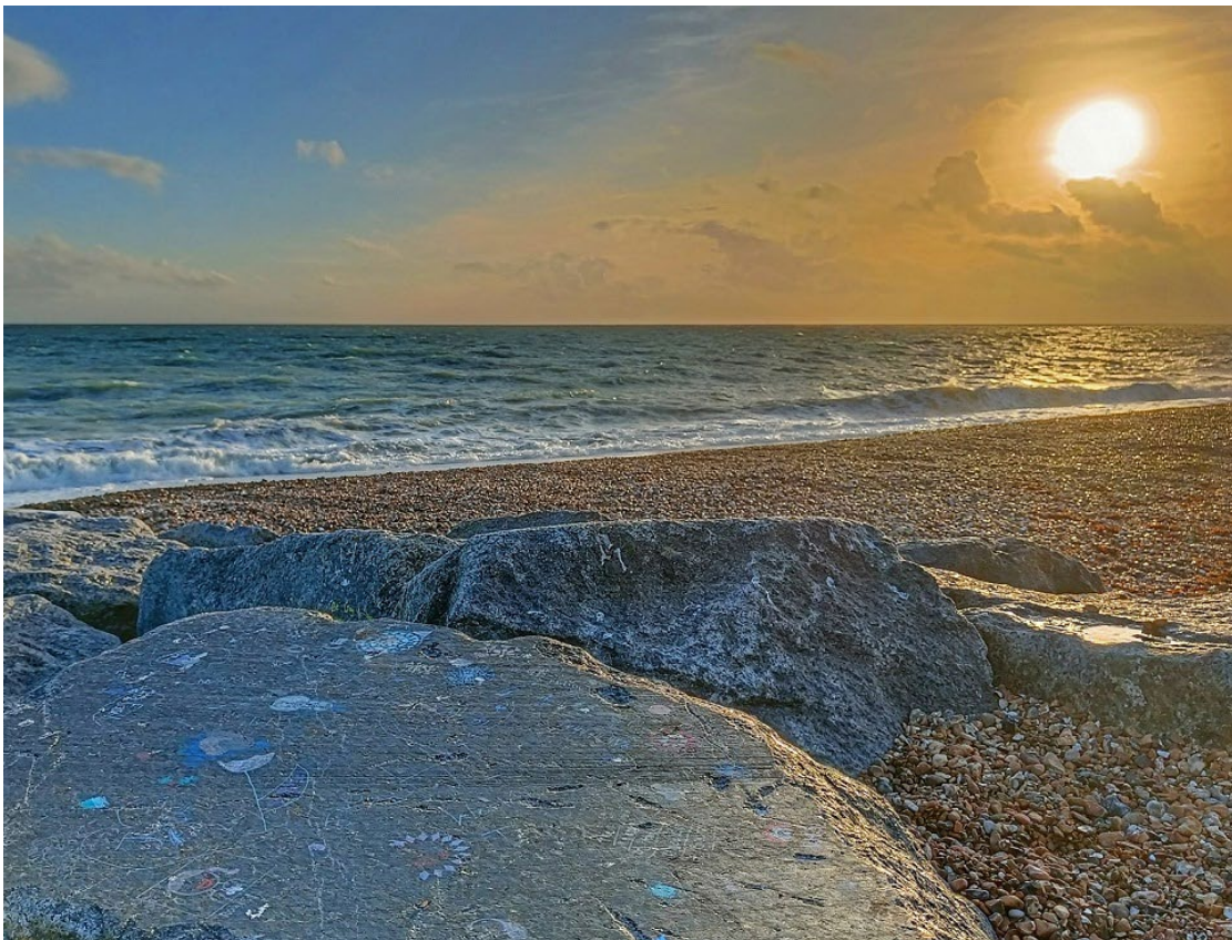
Shoreham rock art