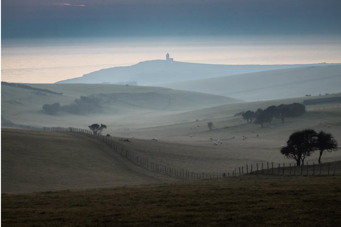
On the South Downs with Belle Tout Lighthouse in the far distance.