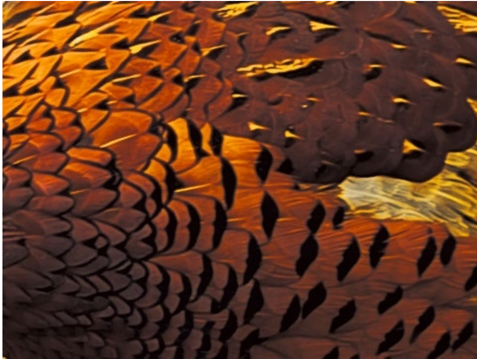
Bronze plumage of a cock pheasant