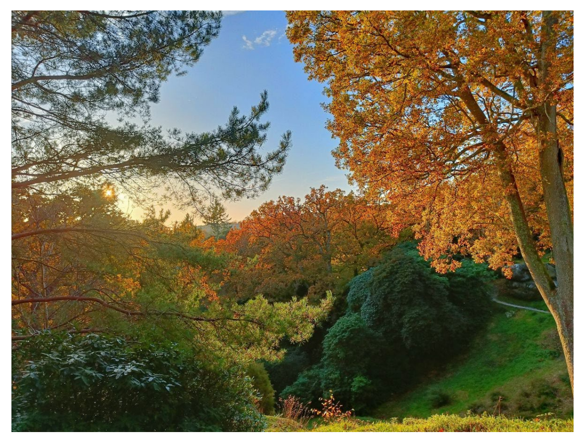
Wakehurst's autumn colours