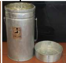
Wide top cryogenic flask, 4 litres, to hold liquid nitrogen during FKB test.