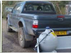
Transporting Dewar flask of liquid nitrogen by vehicle but not in passenger compartment.