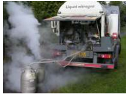
British Oxygen liquid nitrogen truck filling up Dewar flask near LASI apiary

Hygienic behaviour is a natural form of disease resistance effective against American foulbrood, chalkbrood, deformed wing virus, and varroa. Beekeepers can breed hygienic bees by rearing queens (or males to mate or inseminate queens) from hygienic colonies. But how do you know which colonies are hygienic? This pamphlet gives background information on quantifying hygienic behaviour using the freeze-killed brood (FKB) test.