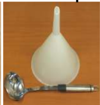
Funnel & ladle, 50 ml, for transferring liquid nitrogen into cylinders.