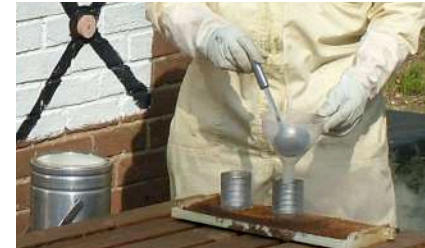
Freezing sealed brood with liquid nitrogen, 150 ml per cylinder. Ladle transfers nitrogen from 4 litre flask, 3 scoops per cylinder, over a few minutes.

of brood, which are quickly removed. Only count the cells inside the circle. Colonies that have cleaned out >95% of the previously-sealed freeze-killed cells are considered highly hygienic. LASI makes 3 or 4 tests per colony at 1-2 week intervals. Colonies being tested should have the same queen throughout and should not receive brood from other colonies. If you are screening hives for the first time for breeding stock, try to test 25-30 or more to have a good chance of finding one or more that are highly hygienic.