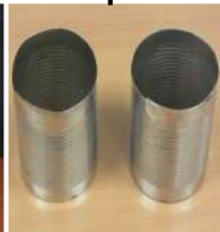
Metal cylinders to press into sealed brood to hold liquid nitrogen.