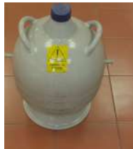
Dewar flask, 25 litres, to hold a large volume of liquid nitrogen.