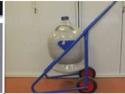
Handcart (optional) for moving Dewar flask. Flask can also be carried by handles.