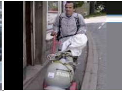
Sack cart being used to transport strapped in Dewar flask 1 mile on foot to apiary.