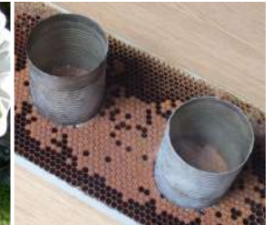
Liquid nitrogen boils at -196°C so is soon all gone. The cylinders now have frost on them.