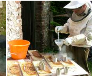
Brood from several colonies can be treated at once. Another person removes and replaces test frames.