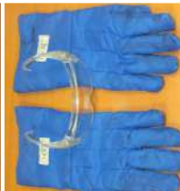
Hand & eye protection. Follow regulations, use care and common sense.