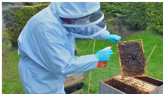
Spraying. Frames lifted, and OA solution sprayed onto bees.