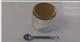
Measure. A half teaspoon measure, 2.5ml, is almost exactly 2.25g OA.

To apply OA via sublimation you need: 1) applicator tool (several types are sold); 2) battery (12 volt lead-acid battery as used in cars and caravans); 3) oxalic acid (technically "oxalic acid dihydrate"); 4) mask; 5) measure (half a teaspoon of OA weighs c. 2.25 grams); 6) foam to temporarily seal hive entrances.