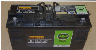
Battery. This 12v lead-acid battery can power the tool for 8-9 hours.