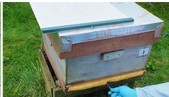
Sublimation. Heated tool in hive entrance to vaporize OA crystals.