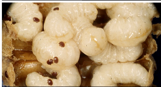
In Cells. Varroa in capped cells are not killed by OA application.