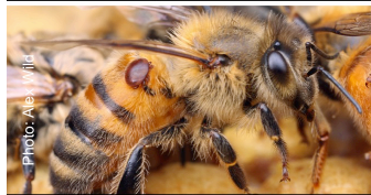
Phoretic. Varroa clinging to adult bees can be killed by OA.