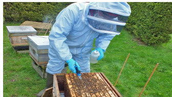
Trickling. Hive is opened & oxalic acid solution poured onto the bees.

Hives are treated with OA by Trickling , Spraying , and Sublimation (also called Vaporization ). Trickling and spraying apply OA in solution. In sublimation, OA crystals are heated with an applicator tool. The heat causes the crystals to sublime (turn directly from solid to gas). LASI research compared these methods at several OA doses. Sublimation was best: effective at killing varroa at lower doses, not harmful to the bees, and not needing the hive to be opened.