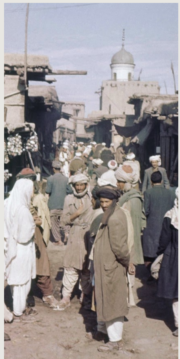
Street scene in Kabul, Afghanistan in November 1961.

The novel's central narrative device is an alley ( kuche ) in Kabul in which people of different ethnic, religious, and social backgrounds live with one another and get on with their daily lives. Besides emphasising the varying social identities of Kabulis, however, the book also presents its characters as fully fledged humans with unique individual personalities. The book is not restricted to a discussion of