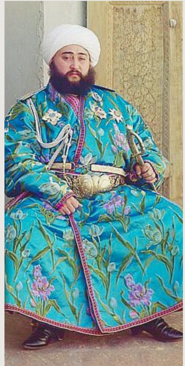
Emir Alim Khan of Bukhara, last emir of the Uzbek Manghit dynasty, rulers of the Emirate of Bukhara in Central Asia