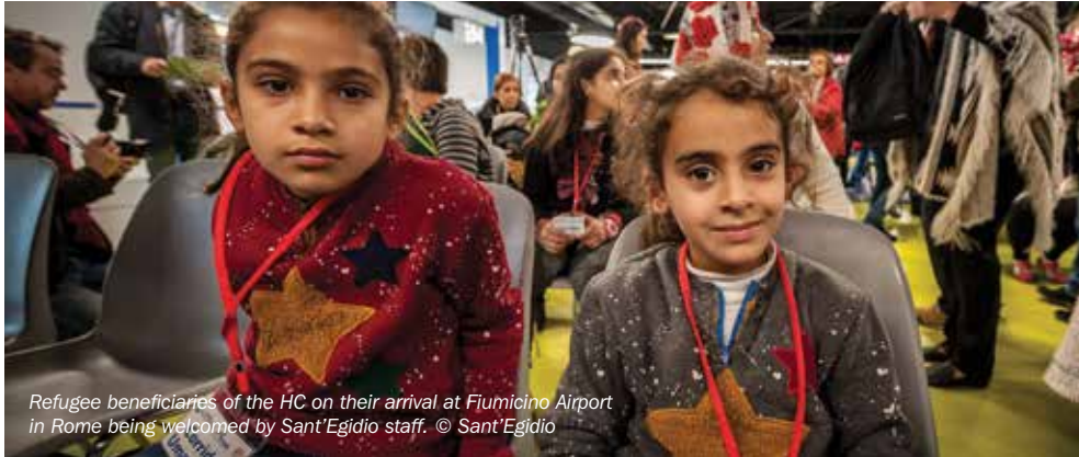
Refugee beneficiaries of the HC on their arrival at Fiumicino Airport in Rome being welcomed by Sant'Egidio staff.