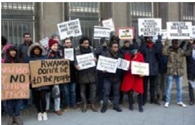
Demonstration in Berlin, calling on the Rwandan government not to accept refugees deported from Israel