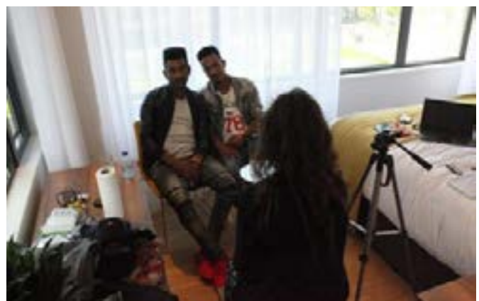
Interview conducted in Holland, August 2017