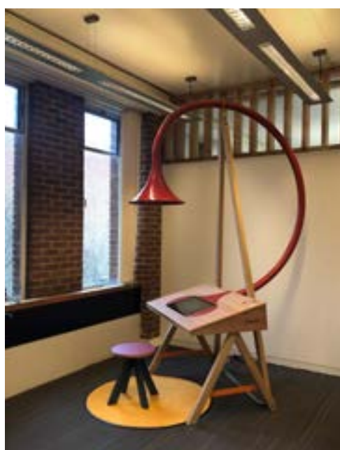
The Listening Desk