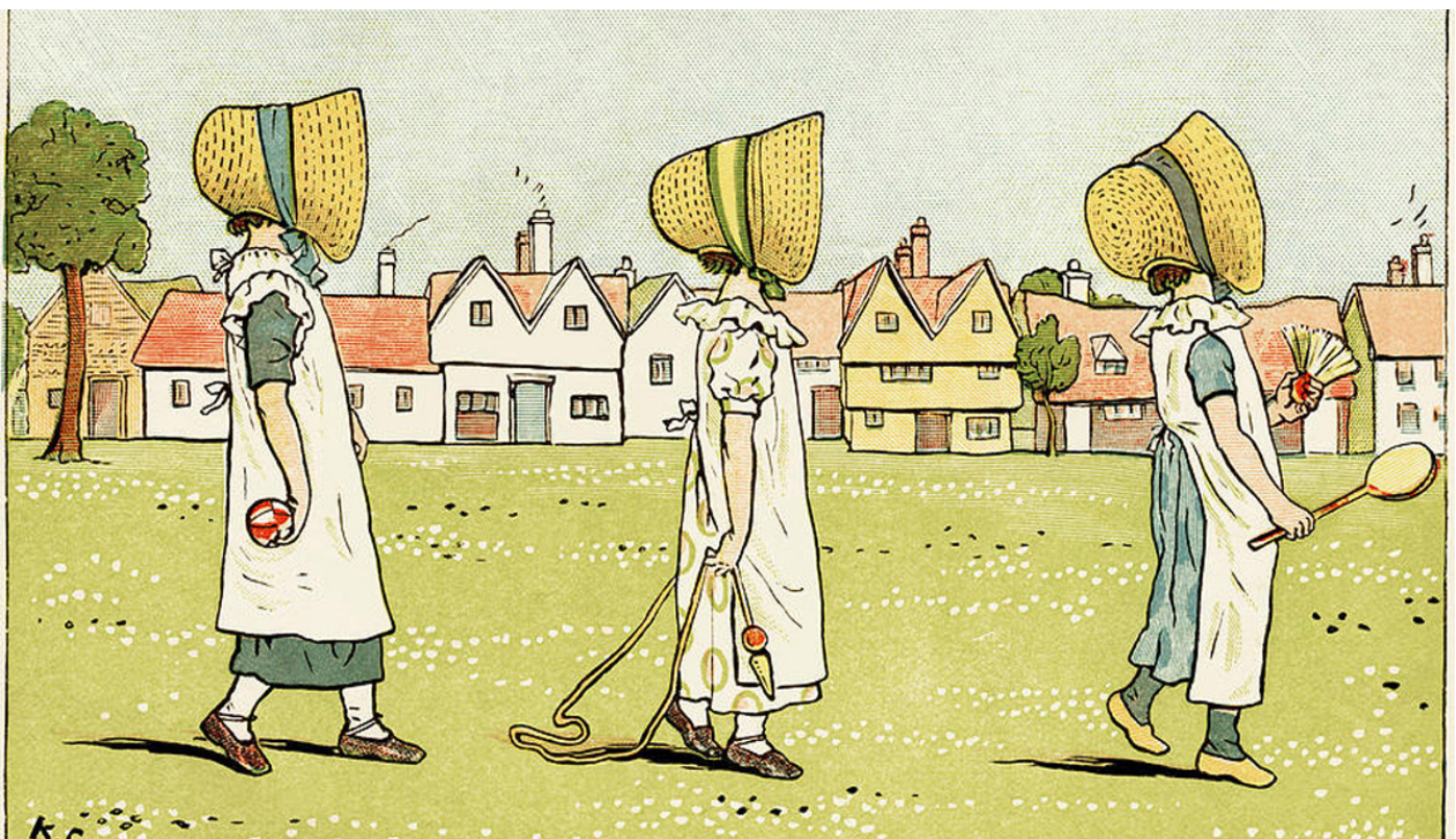
Image: children's fashion from Kate Greenaway *Under the Window* (1878). Public domain

And please let us know if you have any ideas for members' events or seminars, or need any support with developing research bids, or other research-related activities, such as networking events or conference attendance.