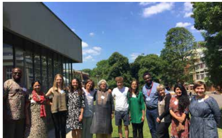
Global and UK partners