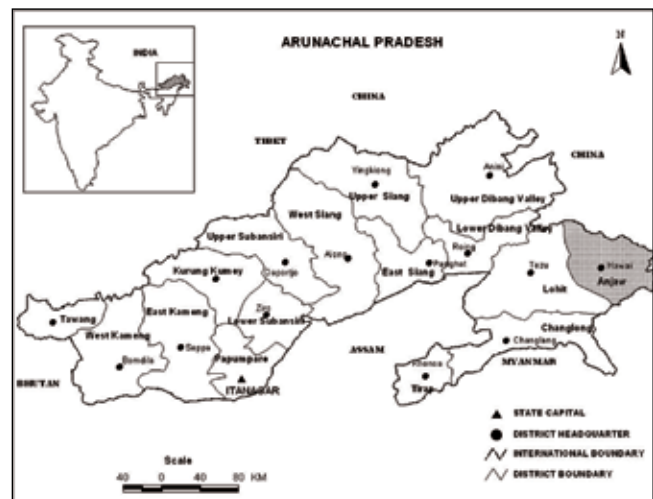
Fig. 1. District map of Arunachal Pradesh

Hayuliang is the functional headquarters of Anjaw district (officially, Hawaii is the headquarters) and is a Block Development Office. Except for Manchal, Hayuliang, and Walong, other locations lie along the Indo–China border. Walong and Kibithoo have large army establishments. The local population belongs to the Meyor and Mishmi tribal groups. Around 120 exogamous clans