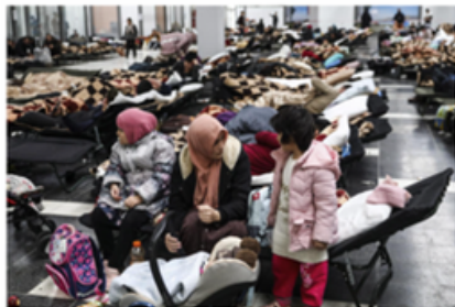
Bukharierne i Ukraine fra den afghanske diaspora, indvandre og adlyde lokale domstole - en af de millioner i Ukraine i marts. De afghanske kvinder har længe været en vigtig del af den afghanske diaspora i Danmark.