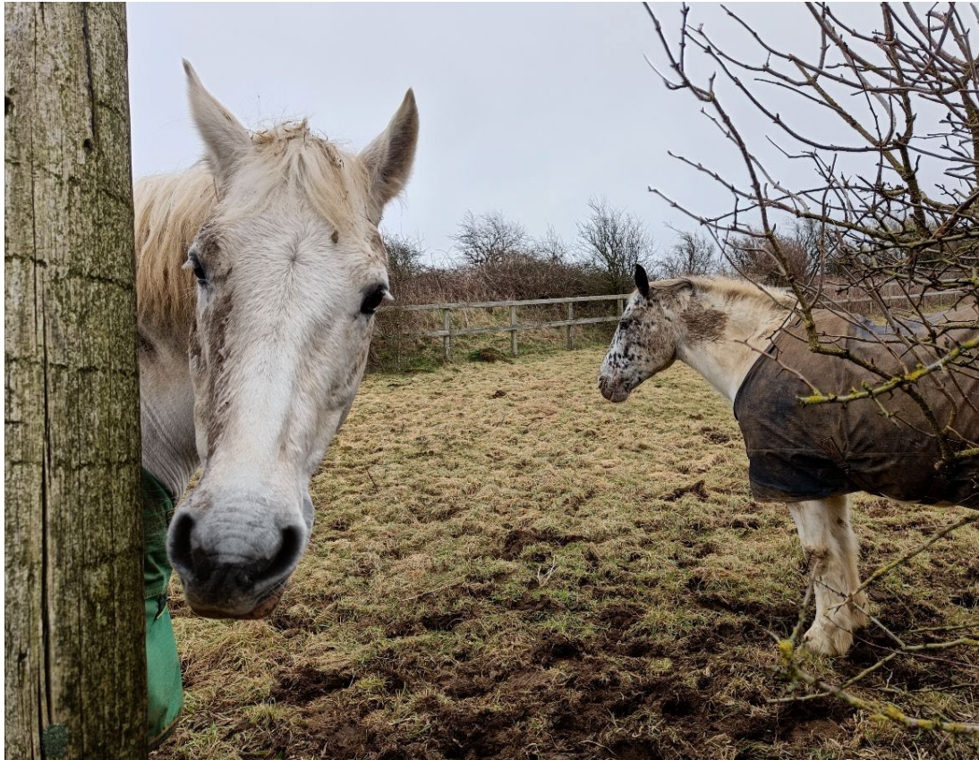
Horses sheltering from the wind near the Jack and Jill windmills near Clayton