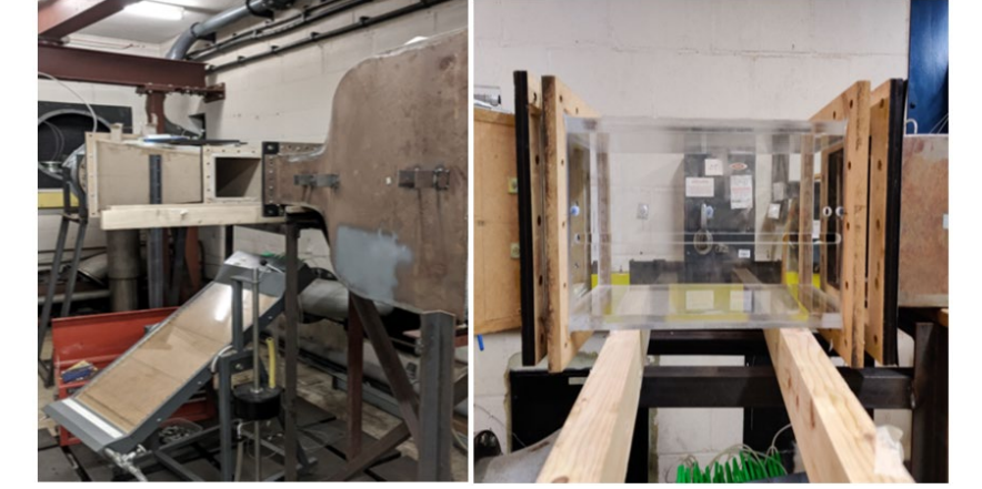
Figure 3 – Potential Modification to Test Section to impose Pressure Profile