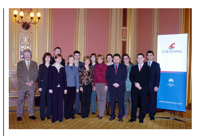
The 2006-07 Chevening Fellows