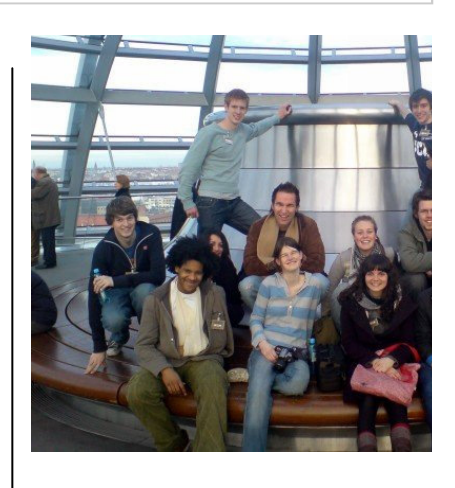
Sussex students in Berlin's Bundestag

All of the students had either taken the course entitled 'Political Change: Modern Germany', or they are currently taking 'Political Governance: Modern Germany' course.