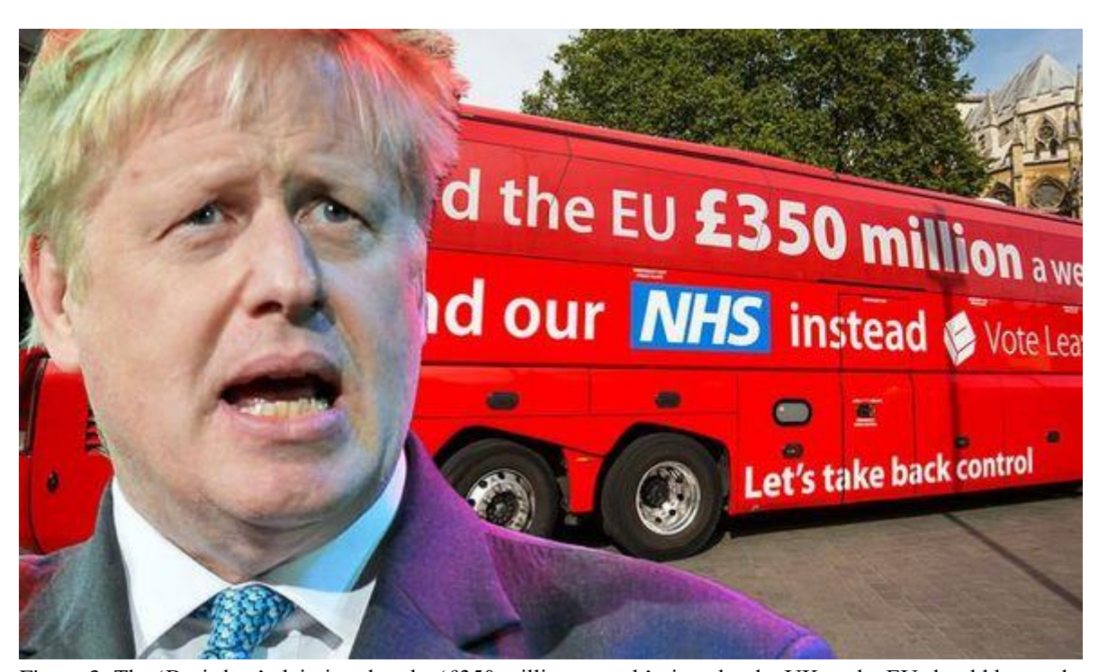
Figure 3: The 'Boris bus' claiming that the '£350 million a week' given by the UK to the EU should be used to 'fund our NHS instead'.

Hence, what the Brexit vote revealed was a sharply divided population, the poorest, oldest and least-educated of whom were angry – at the political class, at the falling standards of living resulting from austerity policies and, more nebulously, at the way they had seemingly been left behind by globalisation and its divisive and polarising effects, expressed also spatially in terms of North (including the Midlands) versus South (especially London). The voters were somehow persuaded that immigration – especially uncontrolled immigration from the EU – was the 'main issue' that the country faced, with the implication that, once the borders were better controlled, their problems would be solved or, at least, lessened. Another persuasive argument, which was never properly fact-checked, regarded the net budgetary cost to Britain of remaining in the EU and the economic savings that could be accrued by leaving. A controversial and duplicitous image here was the 'big red bus' that Boris Johnson used in the campaign with the slogan emblazoned on its side, 'We send the EU £350 million a week: let's fund the NHS instead' (see Figure 3).