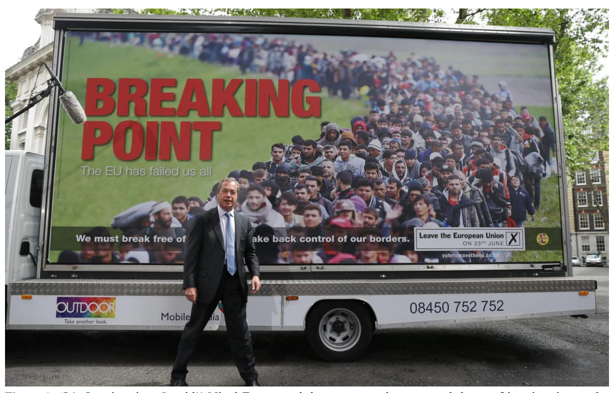
Figure 1: 'It's Immigration, Stupid!' Nigel Farage and the poster on the supposed threat of immigration to the UK.

On the other side of the campaign the message was clearer and more visceral: people were urged to vote 'Leave' in order to 'Take Back Control' of Britain's borders, laws and sovereignty. The famous 'Breaking Point' poster (Figure 1) remains the most iconic representation of this message, fronted by then UKIP leader Nigel Farage. The image on the poster portrayed an endless queue of 'immigrants' supposedly threatening 'our borders'; in fact, the picture is of Syrian and other refugees waiting at the border between Greece and (North) Macedonia during the so-called 'refugee crisis' of 2015. The EU was also targeted as the source of countless bureaucratic and pedantic laws (the shape of bananas was often mentioned); whilst immigrants were scapegoated as an uncontrolled problem (because of freedom of movement within the EU) responsible for unemployment, falling wages, pressure on housing and health services, and cultural and demographic change within towns and cities across the land.