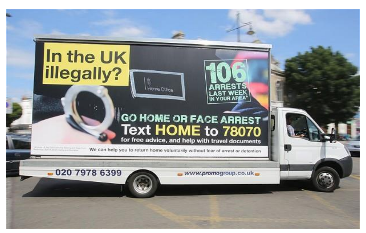
Figure 4: Theresa May's 'hostile environment' policy towards immigrants. Lorries with this poster circulated for a short time in British cities in 2012, urging 'illegal immigrants' to 'go home or face arrest'.

part of the discursive frame and policy environment leading up to the referendum and has continued thereafter. The true nature of the British government's hostile stance on immigration was evident in the 'Windrush scandal' of 2018, when it was revealed that a large, but unknown, number of British citizens, who had arrived as children from the Caribbean in the early postwar decades, had been unlawfully repatriated, or imprisoned, or denied their rights to remain, work and access healthcare in the UK.<sup>13</sup>