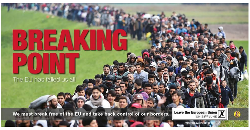
Figure 6: UKIP's 'Breaking Point' poster (Family Advertising Ltd 2016)

Each newspaper displayed images of migrant and refugee crowds that were exclusively Middle Eastern or black, and sometimes Muslim, in appearance (Figure 7). Claims that they were 'on the move' towards Europe or Britain were supported with images of people queueing or travelling in overcrowded boats and may be viewed as a racialised othering strategy, similar to that of UKIP's 'Breaking Point' poster (Figure 6). This promotes restrictive migration, and through deliberate omission of white people, specifically implies that non-white and Muslim migration threatens Britain (Virdee and McGeever 2017). Such imagery fed into the racialised constructions of 'us' – white British people – and 'them' – immigrant others – that featured strongly in pro-Leave arguments (Bowler 2017: 6), with problematic implications about who should and should not live in Britain.