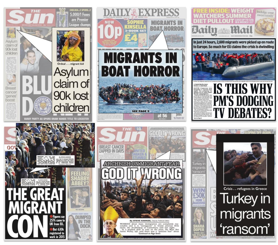
Figure 7: Depictions of the migrant crisis