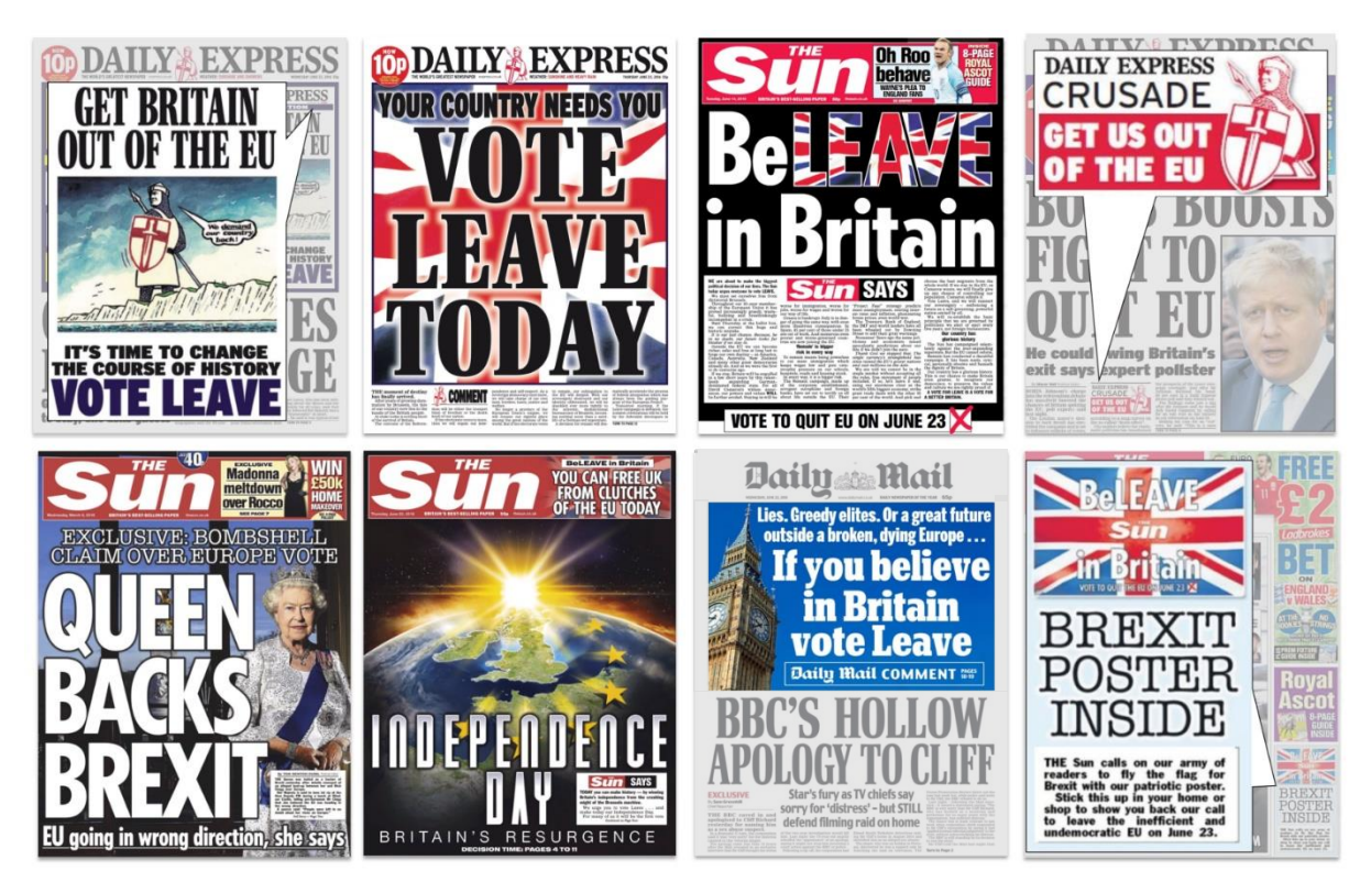
Figure 17: Direct appeals to readers' sense of national pride

Talk of 'trading freely with the whole world' usually implied renewing Old Commonwealth trade links with Britain's 'Anglosphere', which pandered to the desires of those in Britain who do not see themselves as part of Europe culturally (Pajakoski 2017: 26). Such postcolonial melancholia, exemplified in Liam Fox's plans for 'Empire 2.0' and his tweet that Britain 'does not need to bury its 20<sup>th</sup> century history' (Dorling and Tomlinson 2019a: 56), reflects a wilful occlusion of the British Empire's brutal and racist history, and the ongoing colonial legacies which reinforce uneven capitalist development between the rich elite and the working class – both white and non-white (Andrews 2016; Virdee and McGeever 2017). Ultimately, the right-wing press helped to sustain Britain's selective memory and delusions of grandeur. This provided a short-lived sense of ontological security, by promising to restore Britain back on its natural progression of 'greatness' and fed into the reproduction of national identity and difference (Beaumont 2017; Manners 2018).