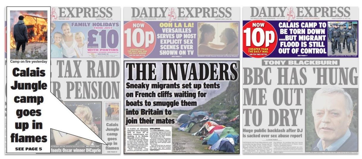
Figure 9: Depictions of the Calais 'Jungle'

Constructing RASIM: victims or villains?