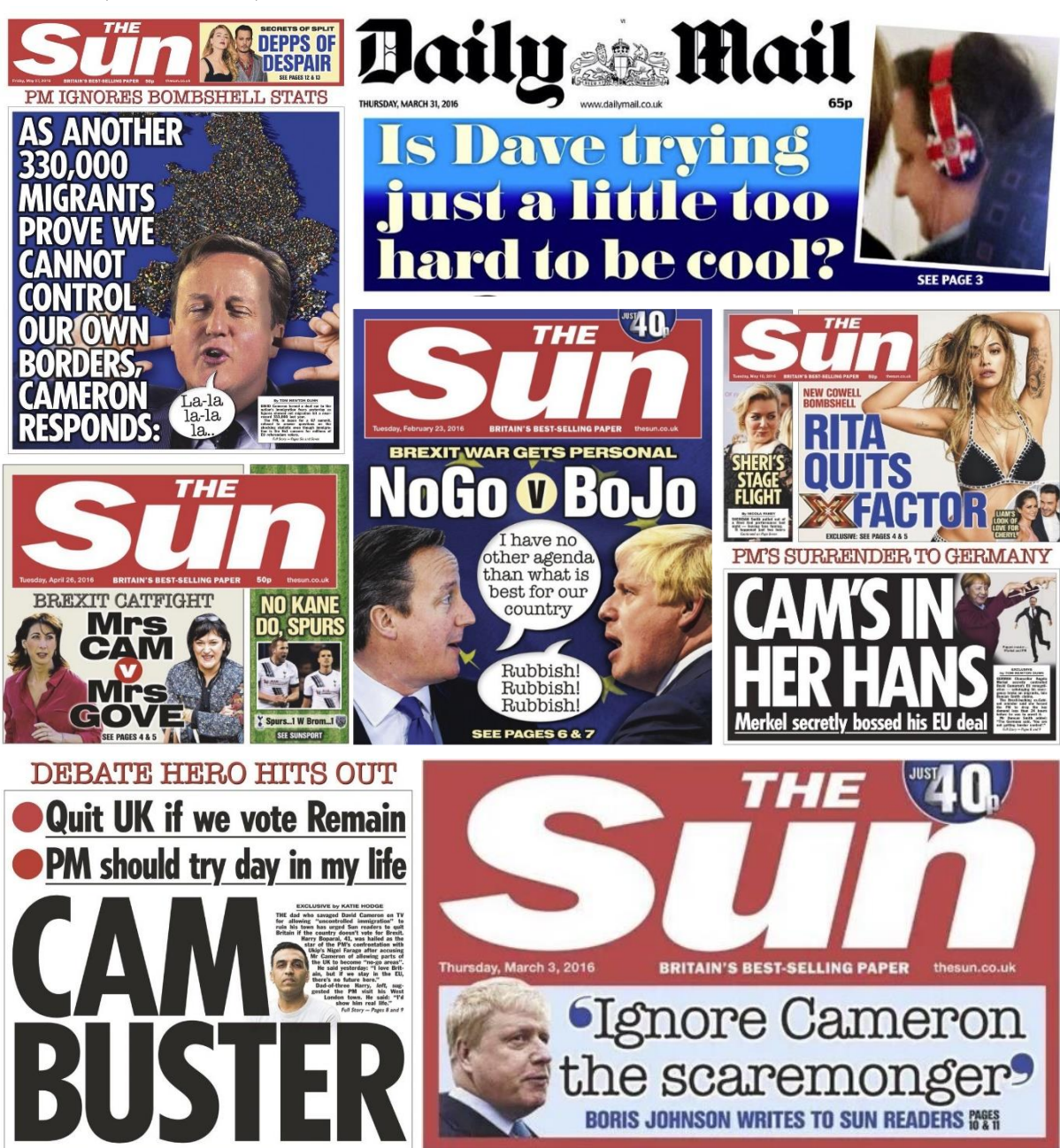
Figure 12: Depictions of David Cameron (of the establishment)

versus the politicians' (The Sun, 07/04/16). Populism is 'of the people, but not of the system' (Canovan 1999: 3) and, whilst figures such as Farage and Boris Johnson are elite, wealthy and privately educated, they distinguished themselves from 'politics as usual' and positioned themselves as 'the last authentic representatives of the British people', through personalised leadership and populist rhetoric (Calhoun 2017; Clarke and Newman 2017; Virdee and McGeever 2017: 1808). Contrastingly, Cameron was blamed for trying 'too hard to be cool' and The Sun praised one 'hardworking' 'debate hero' for suggesting, on live TV, that Cameron had not experienced 'real life' (Figure 12). Personal stories from 'ordinary people' featured in Leave arguments to demonstrate that the pro-EU elite, insulated by their wealth and social position, are out of touch with working-class realities, so cannot authentically represent 'our' interests (Naidoo 2016).