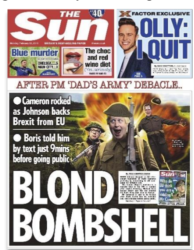
Figure 15: Depiction of key campaign figures through intertextuality

Continuity with past events and traditions makes political decision-making appear legitimate (Cap 2016). Throughout the campaign, collective memories were used to define the limits of acceptable action, and to frame desirable futures (Bonacchi et al. 2018; Manners 2018). However, the future constructed by pro-Leave tabloids relied not on long-accepted pragmatism but on misplaced nostalgia for an imagined past, which offset the ontological insecurity generated by Britain's perceived fall from 'greatness' (Beaumont 2017).