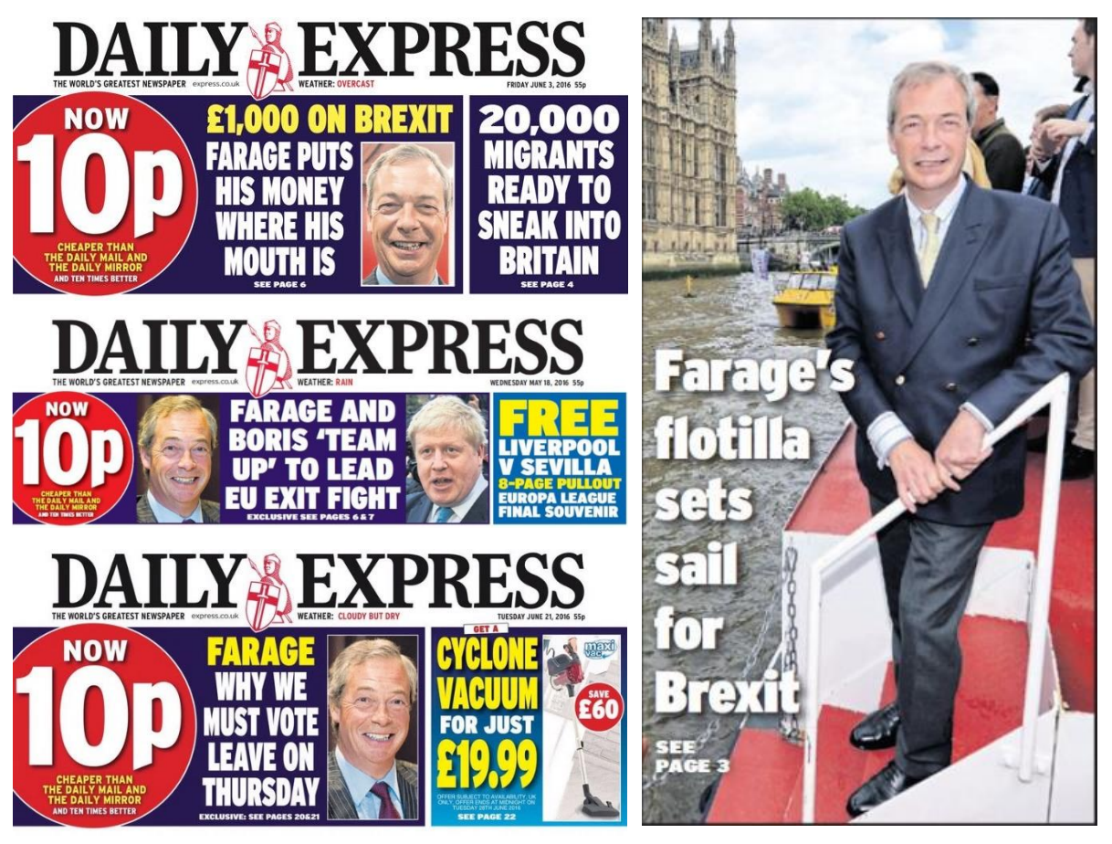
Figure 13: Depictions of Nigel Farage and Boris Johnson (of the people)