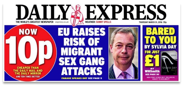
Figure 14: Example of how The Express positioned the EU as a threat

Continued EU membership and integration were presented as threatening to sovereignty. The EU was described as 'hegemonic', 'shackling', 'bullying' and 'interfering'; a 'regime', 'empire' and 'law making machine'. EU elites were labelled 'arrogant', 'greedy', 'hubristic' and 'federalist ideologues' (Table 8). The EU was blamed for 'meddling' 'too much' in British people's lives, with headlines such as 'breast cancer victims denied lifeline', 'EU wants control of your pension', 'EU wants to ban our kettles', 'EU destroys British jobs', 'Brits have to do as EU say' and 'plot to seize control of our Armed Forces' (Table 8). It was held responsible for the previously mentioned threats associated with RASIM, with headlines such as 'deadly cost of our open borders', 'EU wants asylum control', 'EU tells Britain to build more homes', and 'EU threat to family life' (Table 8). It was further blamed for 'letting in' 'terrorists' 'killers' and 'rapists' (Table 4), and Farage was used to authorise this position (Figure 14).