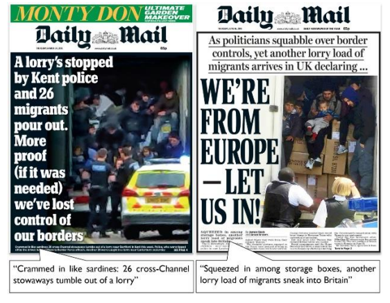
Figure 8: Depictions of 'Illegal Migrants'