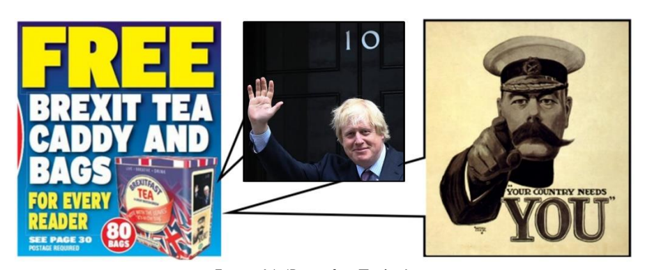
Figure 16: 'Brexitfast Tea' advert