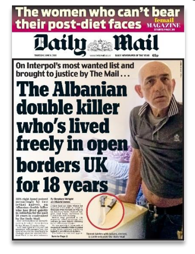
Figure 11: Depiction of RASIM as a criminal threat

Bulgarian, Romanian and Polish RASIM were demonised for their imagined poverty and for claiming benefits, for example: 'you pay for Roma gypsy palaces' (Table 5). Candidate countries, especially Albania and Turkey, were singled out to present continued EU membership as a threat. Decontextualisation, for example, of Turkey's murder rate and human rights record, and single criminal cases (e.g. Figure 11), problematically positioned these countries as inherently dangerous and thus incompatible with Britain. The Express (31/03/16) blamed non-EU countries for failing to 'adopt Western values' and quoted Farage stating: '[Turkey is] too big, too poor, too different from us' (05/05/16). Despite factual 'evidence', arguments such as these are devoid of migrant voices, positivity or sober analysis (Crawley et al. 2016; Moore and Ramsay 2017), but since they represent mainstream discourse, audiences have little recourse for hearing countervailing stories (van Dijk 2000). This promotes scripting