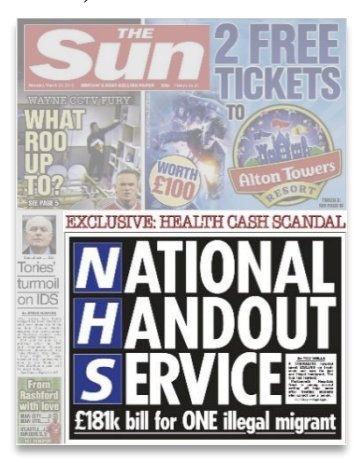
Figure 10: Depiction of RASIM as a socioeconomic threat

taught to fear and hate immigrants . . . and any other group which is weak' (Dorling 2013: 5). The political elite use such discourse to frame years of deliberate and harmful austerity as an apolitical necessity, and to pin its effects on catch-all scapegoats such as RASIM (Naidoo 2016; Tuckett 2017). This elides fractures within British society by promoting nationalist sentiment that emboldens people to defend their imagined communities and way of life (Ivarsflaten 2005).