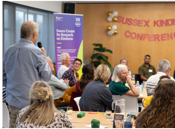
Audience Q&A session following panel session with business leaders