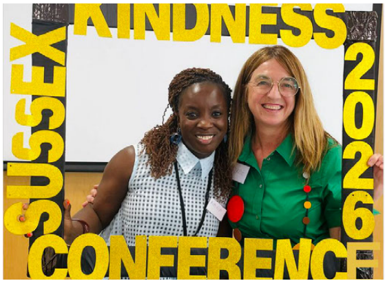
Moments of connection and community as participants capture memorable photos