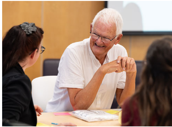
The coffee break fosters warmth, connection, and meaningful conversations