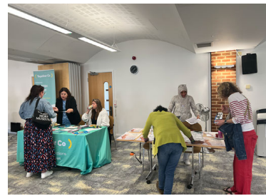
Kindness Marketplace Exhibition