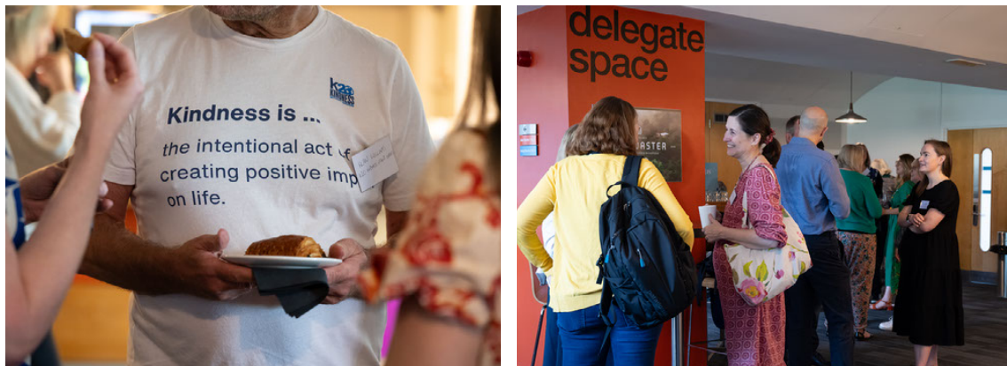
A warm and welcoming atmosphere takes shape

If you'd like to stay connected with our work, hear about future events, or get involved in our growing community, we'd love to hear from you. You can contact us at kindness@sussex.ac.uk and join our mailing list via our website to receive updates, opportunities, and the latest insights from the Centre.