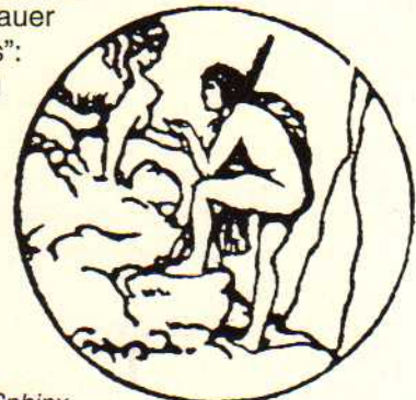
Medallion showing Oedipus solving the riddle of the Sphinx

For further information, please contact the Tavistock Clinic, 120 Belsize Lane, London NW3 5BA, tel. 0171 447 3829/3715. Friends of the Centre qualify for the concessionary registration fee of £70.