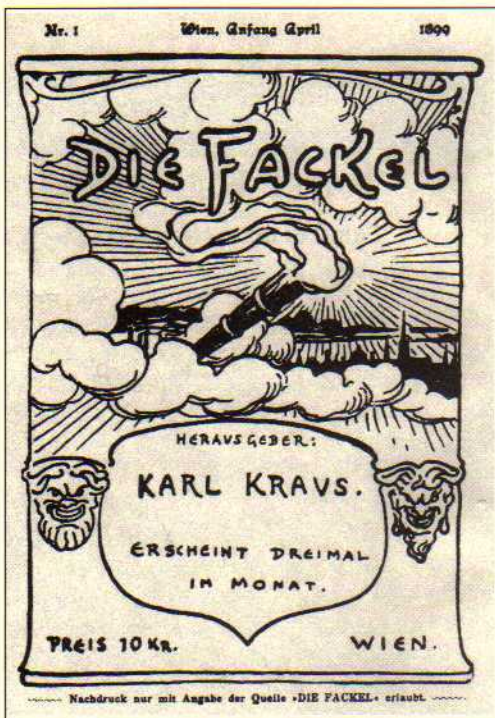
Original cover design of Die Fackel