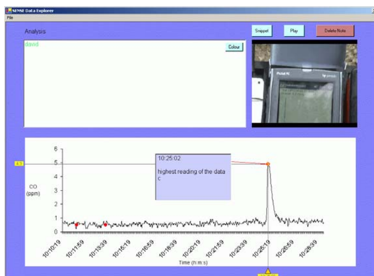
Figure 5. SENSE user interface for reviewing, annotating and sharing data