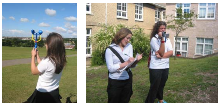
Figure 4. Learners gathering wind and video record data in the field