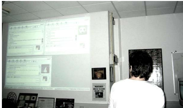
Figure 2. Researcher types messages from the class to three remote scientists.