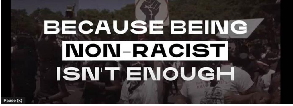
(Introductory video from Union Black Course)

To support increased participation, communications will be created to include a step-by-step guide to accessing the course, which will also include a testimonial to generate increased interest.