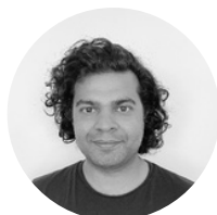
Dr Suraj Lakhani

Dr Lakhani has also published a working paper titled, "Video Gaming and (Violent) Extremism: An exploration of the current landscape, trends, and threats, Radicalisation Awareness Network (Policy Support) with the European Commission. The detailed paper is available at https://ec.europa.eu/home-affairs/system/files/2022-02/EUIF%20Technical%20Meeting%20on%20Video%20Gaming%20October%202021%20RAN%20Policy%20Support%20paper_en.pdf