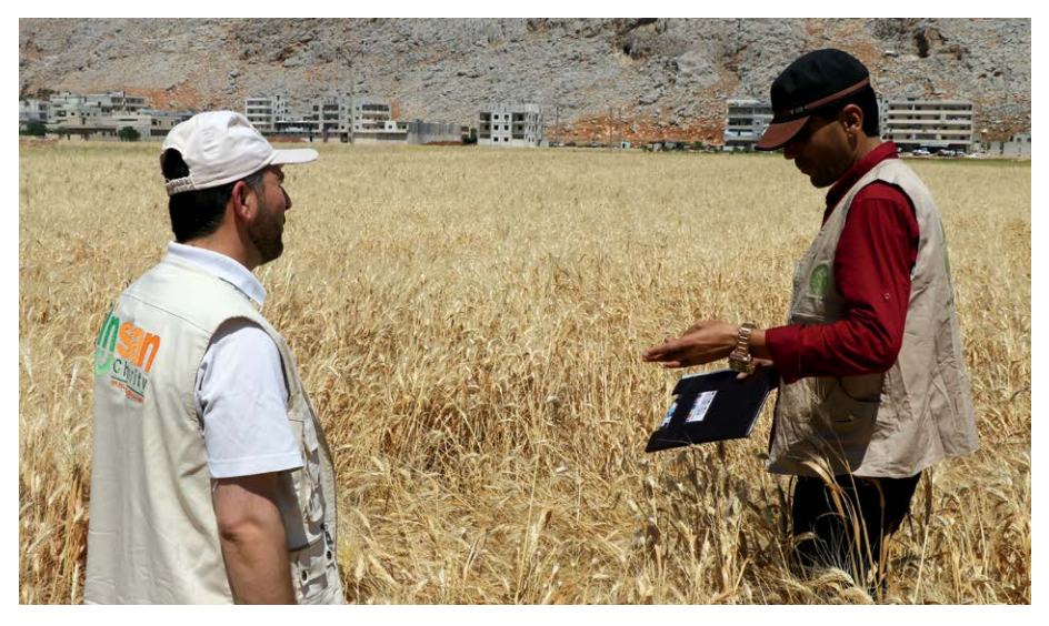
Agricultural expert provides guidance to a farmer in Syria

Speaking of the next steps for the project, Barbu says: "We aim to extend our achievements by engaging more farmers in Northwest Syria. We also plan to broaden the podcast's content with additional topics. Ultimately, we hope AVS can be replicated in other conflict-affected territories, where conditions permit."