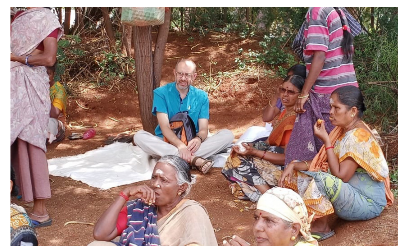
Observing an NREGA work site in Tamil Nadu, September 2019