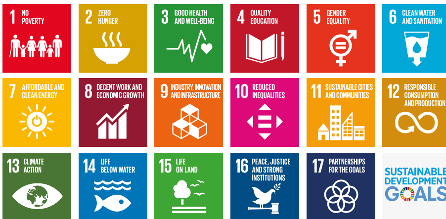
◀ The 17 United Nations Sustainable Development Goals.

You can see how each theme corresponds with the following SDGs on page six of this document.