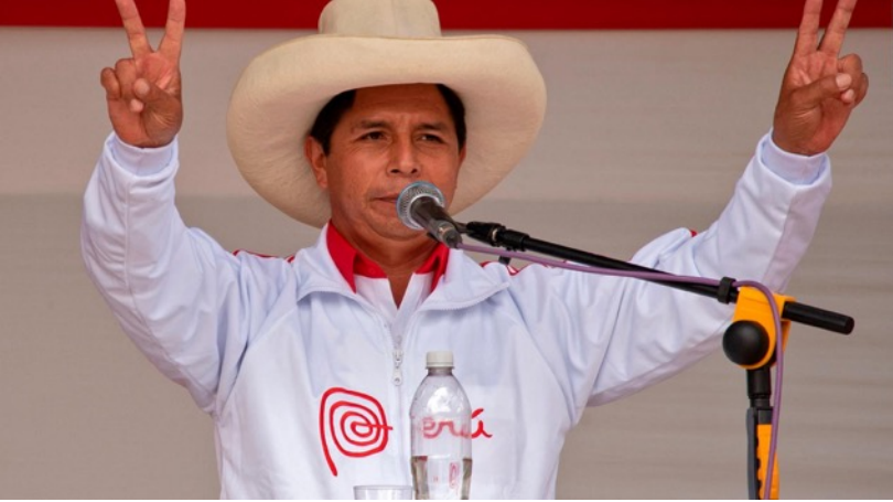
President Pedro Castillo