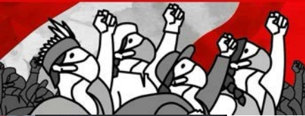
+51 959 993 600 - Shimpu Arte