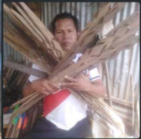
El coordinador del comando matico se alista para la marcha esto recién comienza