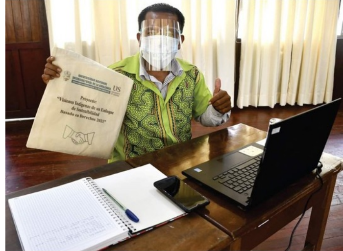
Collaboration with UNIA, Pucallpa, Peru