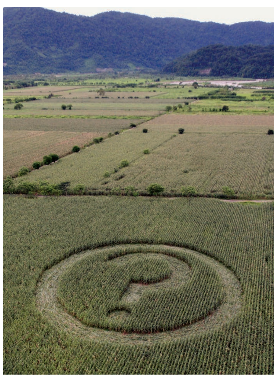
A UK crop circle, created by activists to signify uncertainty over where genetic contamination can occur.

OBITUARY Brian Marsden, keeper of comets, remembered p.1042