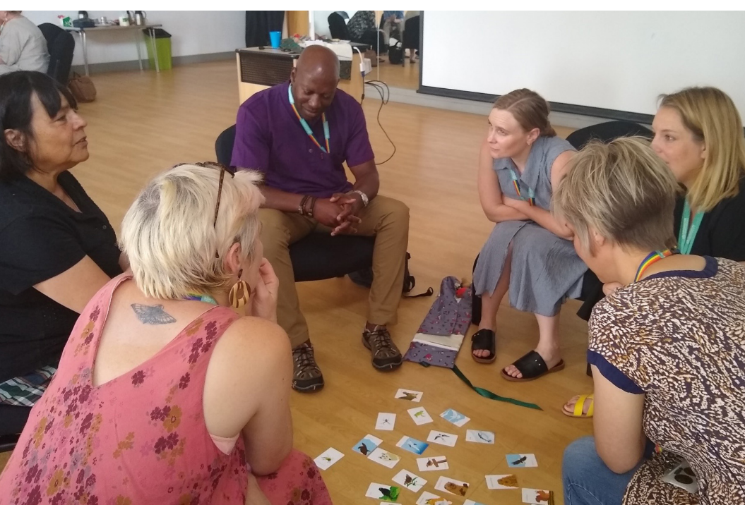
Social workers engaging in TLC Kitbag workshops