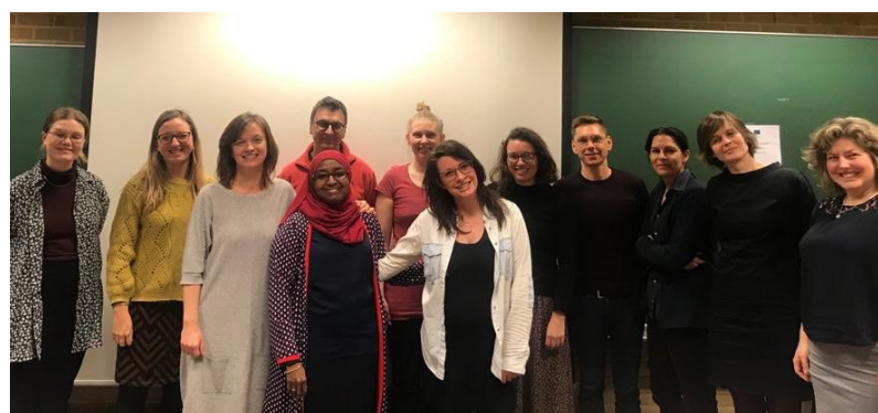
RefugeesWellSchool meeting between partners in Ghent in early 2020