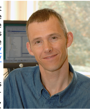
Dr Tim Bale

In fact, 2008 looks like being a productive one for me, book-wise. This spring also sees the publication by Palgrave Macmillan of the second edition of my textbook European Politics: a Comparative Introduction , more detail on which can be found on its website http://www.palgrave.com/politics/bale/guide.htm .