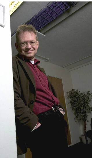
Professor Aleks Szczerbiak

Firstly, the Law and Justice-Party led government's foreign and EU policies were extremely controversial both in Poland and abroad among its EU partners, with a widespread and growing perception that Poland was turning into Europe's 'new awkward partner'. These increased tensions were highlighted during the election campaign when Poland blocked EU plans to hold a European day against the death penalty. For its part, Law and Justice made a virtue of the fact that it had significantly re-orientated Poland's approach to foreign policy which, it argued, needed to be 're-claimed' from a post-1989 establishment that had been over-conciliatory and insufficiently robust in defending Poland's interests abroad, especially in the EU.