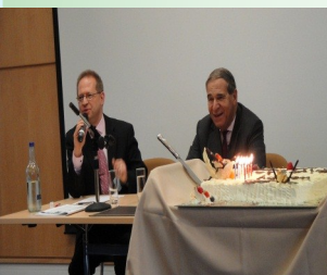
Lord Brittan enjoying his cake!

Lord Brittan, the keynote speaker was presented with cake, because as well being the SEI's twentieth anniversary, it was also his birthday that week!