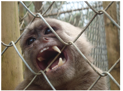
Cebus albifrons rescued from a circus in Quite

Animal rescue centres in primate range countries offer refuge to fauna rescued from trade. To date, few data are available on the composition or turnover of these populations. With potentially significant numbers of globally threatened species, rescue centres could make a significant contribution to their conservation.