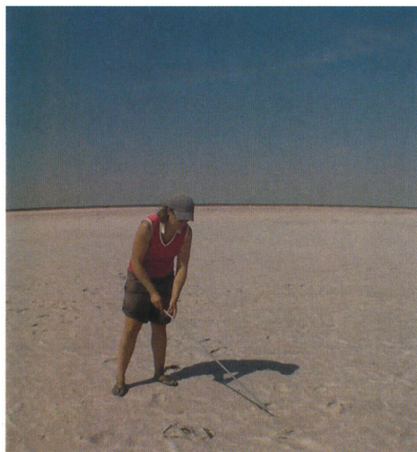
Different food odours were tested for their behavioural responses. The small tubes with the odours were put at the end of the stick and presented to ants that were searching for food.

Imagine the situation of an ant forager leaving its safe nest and searching for a dead insect that could be as small as a tiny fruit fly, somewhere on the desert floor hundreds of metres away. Ants are able to detect dead insects through olfaction, as desert ants are highly sensitive to specific odours emitted by a dead insect. Having detected these airborne odour molecules, they walk against the wind along the odour plume to the food item. Ants have developed a clever strategy to maximise the efficiency of locating these sparsely distributed odour plumes.