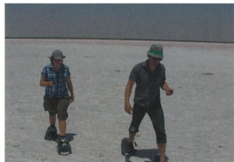
We follow individual marked foraging ants with a handheld GPS device to track their entire foraging journeys.

that ants trained to forage on a route alongside a sequence of artificial odours were able to use olfactory cues for navigation. It is difficult for us to imagine how airborne odours provide spatial information but it seems to be highly beneficial as a complementary navigation mechanism. In general it seems that ants use whatever cue is available to navigate efficiently, and usually they will be using cues simultaneously rather than in a hierarchical way. Studying ant behaviour in their natural environment allows us to closely investigate the ants' natural sensory ecology. It is important to keep this in mind as we hope to gain a better knowledge of the mechanisms behind olfactory navigation and how this interacts with other guidance mechanisms.