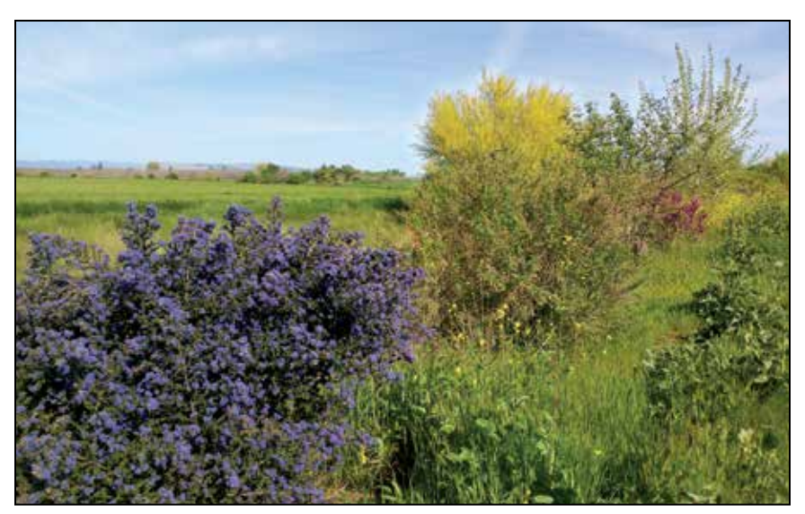
Several years after planting, this hedgerow provides insects with shelter for nesting and season-long bloom for foraging.

bees, these mature habitat areas support less-common bee species. This work shows that we can increase biodiversity in the landscape through specific restoration projects.