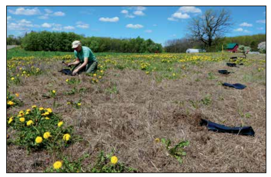
For many farmers, their personal connection to the land both inspires them to improve it for the next generation and justifies all the hard work that doing so entails.

grated directly into the brassica fields aren't helping, especially after seeing these flowers covered in wasps, lightning bugs, and lady beetles during my summer visits.