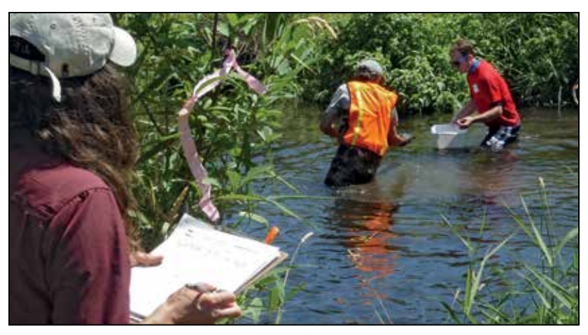
From the day it was founded in 1971, the Xerces Society has built its conservation efforts on a firm foundation of knowledge and scientific evidence. Here, staff and volunteers are gathering data on a population of freshwater mussels.

We harness the power of thousands of people throughout North America to gather valuable conservation data. Through Bumble Bee Watch, individuals from all walks of life help identify