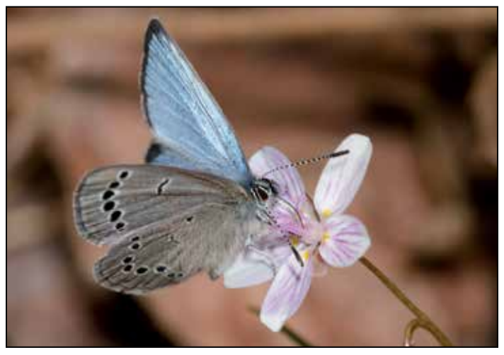
Male silvery blue ( Glaucopsyche lygdamus) nectaring on spring beauty ( Claytonia virginica)