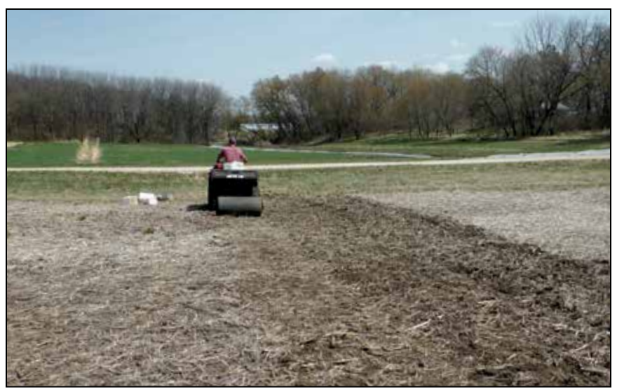
Xerces staff members work with farmers to develop successful organic techniques for the weed control and seedbed preparation necessary to establish wildflower habitat.

In 2014, when I first visited Little Hill Berry Farm, we took some time to evaluate the existing habitat at the farm from the perspective of a pollinator. We found that although there were high-quality nesting areas for bees, food resources were often scarce during the entire length of the growing season. A few deciduous trees provided forage in