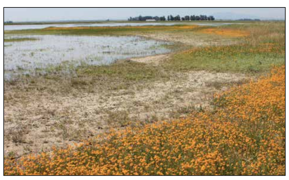
The Central Valley's few remaining vernal pools hint at the landscape that John Muir experienced in the late nineteenth century. In spring, the seasonally drying pools are surrounded by goldfields ( Lasthenia), a member of the aster family, the Compositae noted by Muir.

Since its inception, our pollinator program's work with farmers and the Natural Resources Conservation Service has led to the establishment of more than 420,000 acres of wildflower-rich pollinator habitat across the United States. This includes miles of hedgerows planted in the Central Valley in cooperation with farmers and other partners; hedgerows planted a decade ago have now developed into mature habitats that provide homes for bees, butterflies, birds, and other animals. Recent studies also show that in addition to generalist