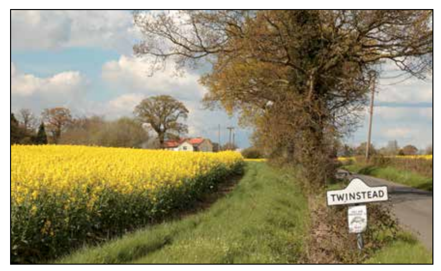
Trees and hedgerows are an essential feature of Britain's countryside, supporting a wide range of plants and animals. Pesticide use in surrounding fields has a negative impact on wildlife.

solitary bees; in Britain, honey bees contribute no more than perhaps 30 percent of crop pollination, the rest coming from wild insects.