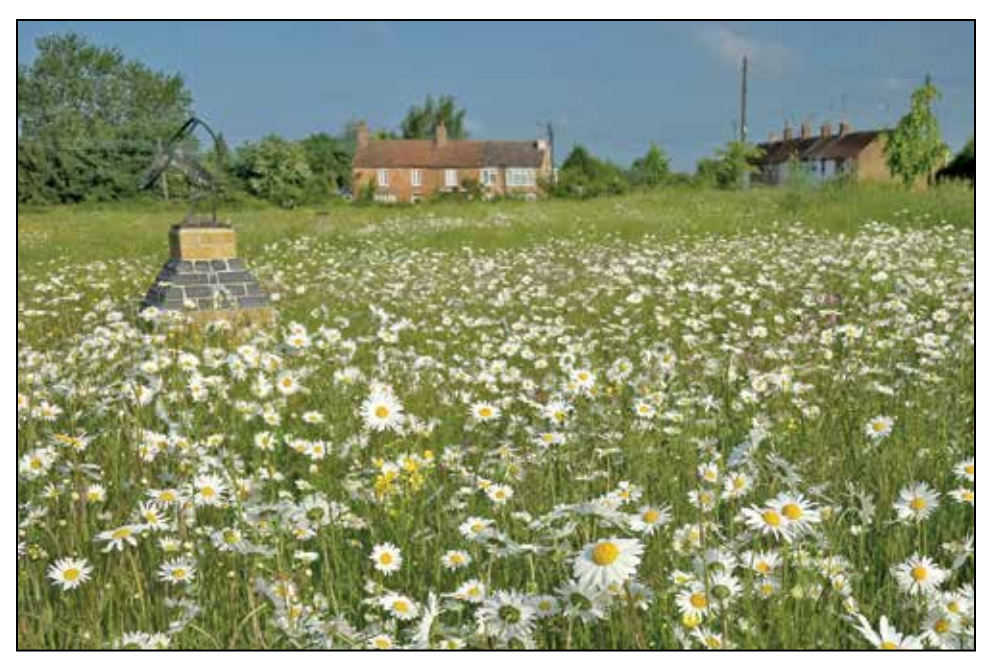
Britain's village greens, which often have flower-rich meadows sheltered from pesticides, can provide valuable habitat for wildlife. Photograph by Mark Schofield / Flickr.

This article is adapted from a post on Goulson's blog, http://splash.sussex.ac.uk/blog/for/dg229.