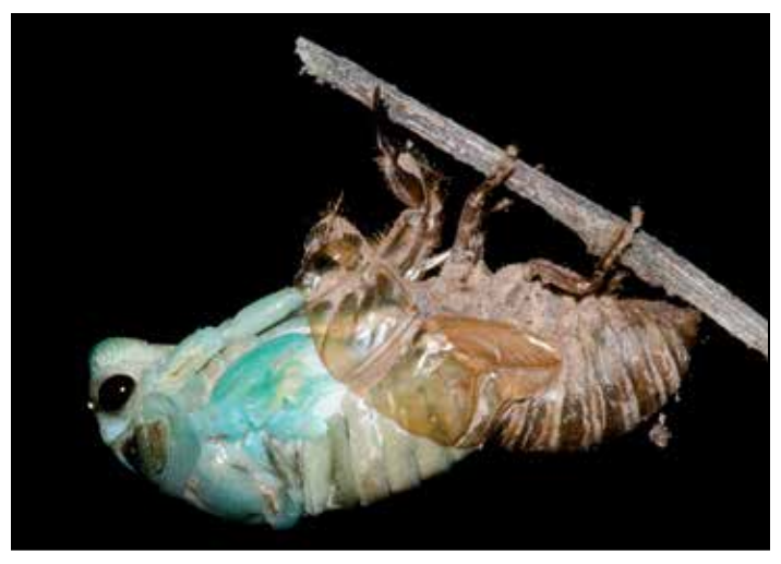
The striking blue color of this emerging lyric cicada (Neotibicen lyricen) will fade as its body hardens and turns darker.