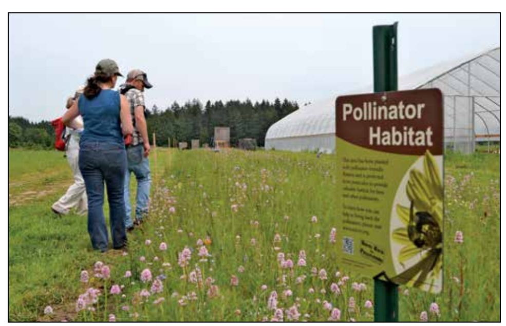
Thanks to a new partnership between General Mills, the USDA's NRCS, and Xerces, half a dozen new pollinator specialists will be working with farmers and agency staff to expand habitat for pollinators.

cialists, who will be managed jointly with the NRCS. This represents a significant expansion of our pollinator team. The new staff will support farmers by working hand-in-hand with NRCS conservation planners to provide individual consultation on habitat restoration and pollinator-friendly farm management practices. They also will help train conservation agency staff in the states where they are based—California, Iowa,