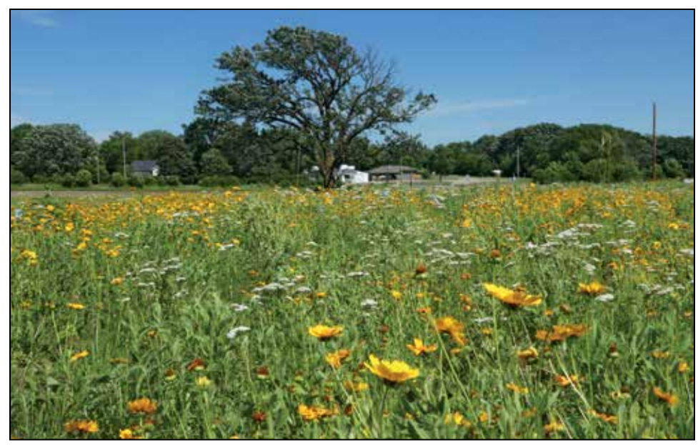
Habitats such as this wildflower meadow are possible thanks to the dedication and hard work of farmers. Though it can take a few years to see this much bloom, these projects are bringing landscape-wide change.

The year before, Erin's planting had been no different from these, a "problem child" for sure—covered in dense crab grass, which, when mowed to control seed set, responded by simply setting seeds lower to the ground. Thankfully, the crab grass itself is a winterkilled annual, and all that new grass