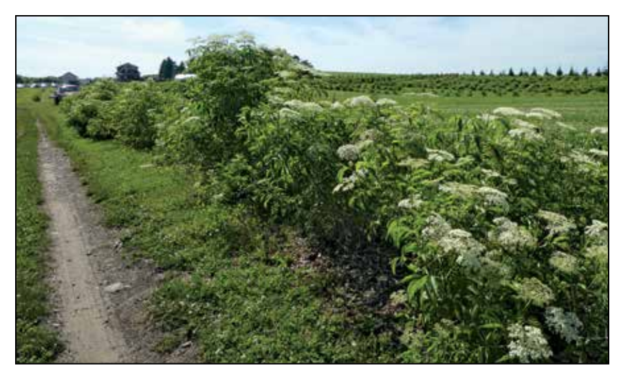
The shrubs in this hedgerow support insects and provide a range of edible fruits. Those include currant and juneberry, though the white flower heads of elderberry are most obvious.

early spring; the blueberry blossoms offered resources in late spring; and after that there was almost no food available other than a few stray goldenrod and milkweed plants in a weedy margin mostly dominated by invasive grasses. To address this deficiency, we planted five "insectary strips" running the length of the farm and evenly spaced across the fields, composed of more than fifty different kinds of native wildflowers and grasses. Now flowering, these strips provide a diverse, season-long food source for bees, while also giving the farm a more wild feel, adding beauty and interest to the U-pick experience. In addition, the habitat helps to hold soil, water, and snow in place, preventing erosion and resulting in more snow deposition on the blueberry plants for much-needed winter insulation.