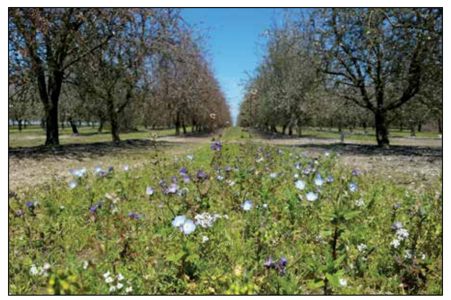
Conservation-minded growers can make a difference by providing habitat. This almond orchard in the Central Valley is being managed to support bees and other beneficial insects.

tor stewardship. We are also rolling out a bee-specific product-rating program this summer. Bee Better Certified will allow farmers and the companies that buy their produce to label their products as Bee Better if they meet requisite standards for habitat management and pesticide stewardship.