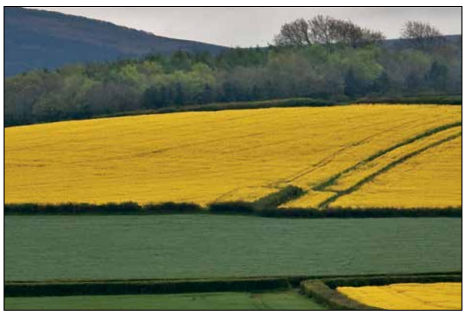
Oilseed rape has long been a point of contention in rural England, its bright color disrupting the bucolic landscape. It is once again at the center of a debate, this time over the impacts of insecticide use on bees.

The researcher's comments can be paraphrased as: "It is all complicated and confusing, and we can't really be sure what harms bees. The moratorium on neonicotinoid use on flowering crops