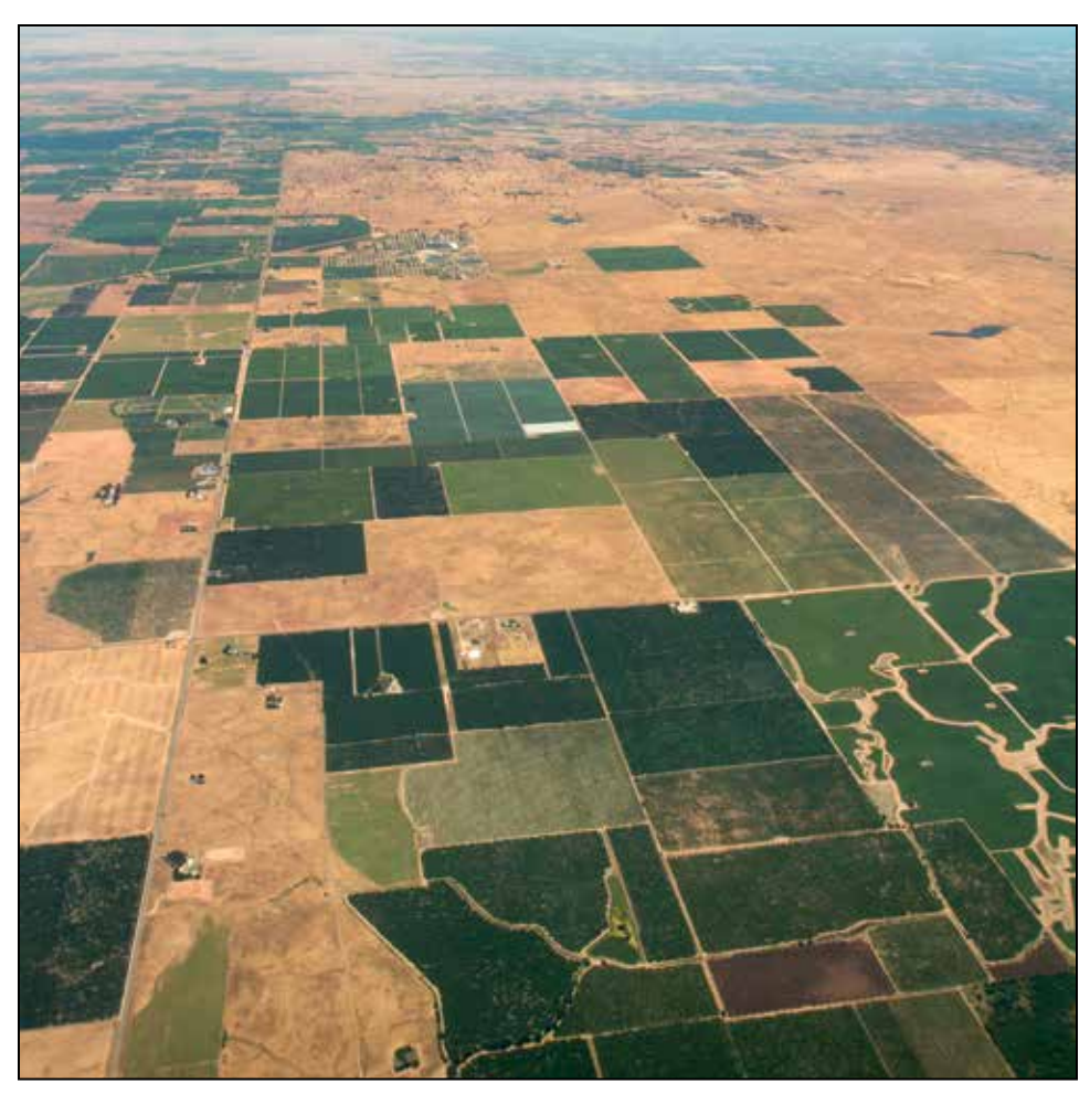
Seen from the air, the scale of the Central Valley landscape's transformation is readily apparent. Crops push right to the Valley's edges, leaving little room for wildlife.

will necessarily be restricted to the field edges, roadsides, and ditch banks, but hedgerows and flowering strips and meadows in these areas will increase the diversity and abundance of pollinators as well as of the predators and parasites of crop pests. Maximizing restoration and management of such linear habitat opportunities will be vital if we want to restore large areas of the Valley.