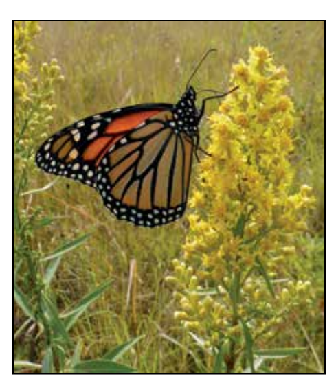
Many growers choose to create habitat not merely to increase pollination support for crop production but also to help monarchs and other wildlife.

These events have been highly successful at encouraging others to pursue similar conservation actions on their lands. For example, following one of our