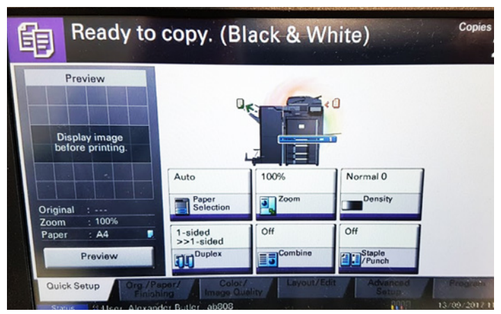
If you would like special settings for your copy, use the options on the screen