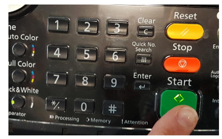
To enter the number of copies you need, use the physical keys. To begin copying, press the green button