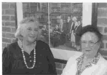
Professor Karen Spärck Jones between them.