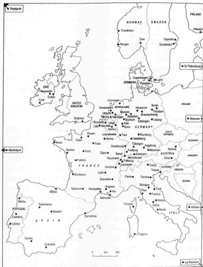
EURO contacts all over Europe

— Some programmes with both research and student-related components, such as INTERREG and LEONARDO, are split between both offices.