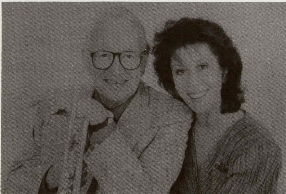
Humphrey Lyttelton and Helen Shapiro