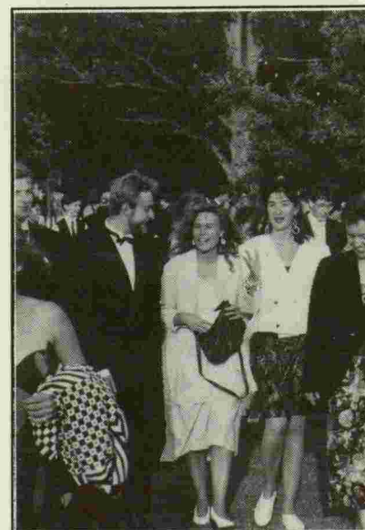
Last year's ball