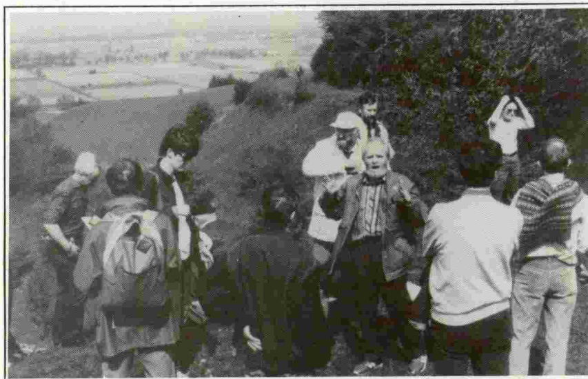
Undertaking fieldwork in the Vistula valley near Torun.

The British geographers then travelled to Torun, an ancient settlement on the north bank of the Vistula, some 200 km northwest of the capital, where they were the guests of the Institute of Geography at the Nicolai Copernicus University and took part in a two-day programme of fieldwork with 14 and 15 year old pupils. The group found that the fieldwork had been carefully planned and it proved to be most stimulating, with the party divided into mixed groups of British