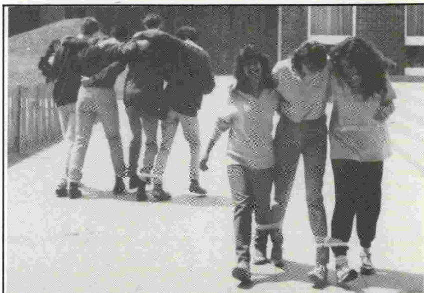
Getting into their stride in the EAPS charity race last summer

The sponsored walk, held last May to raise money for the Royal Marsden Leukaemia Research Fund, raised £3,000, and the organisers would like to thank all those who contributed, either financially or by doing the walk.